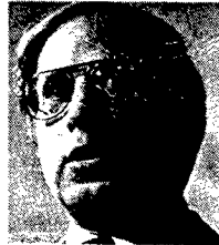
The Honorable Sam Nunn ... United States Senator from Georgia will give the citation.

was named one of the ten Outstanding Young Men in America by the U.S. Jaycees. A highly regarded leader in the U.S. Senate, he has served on the Senate Finance Committee, Agriculture Committee, Committee on Small Business and Select Committee on Intelligence. In 1979, he was listed by Time magazine as one of fifty promising young leaders in America.