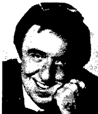
Jim Nabors ... a highly popular and accomplished entertainer from Honolulu, Hawaii will give the citation.

numerous top ten recordings, including "Wheel of Fortune", "I'm the Lonesomest Girl in Town", "Angry", "Bonapart's Retreat" and "Rock and Roll Waltz". She has given numerous benefit performances and continues to perform regularly to rave reviews throughout the United States and overseas. During the 1985 Hall of Fame Banquet she was recognized as Oklahoma Ambassador of Goodwill.