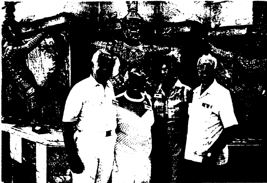
Recalling days of danger and glory: OSS vets and spouses at Bangkok's Grand Palace

Back at Bangkok's Oriental Hotel, the oldsters gabbed away a final evening on the banks of the Chao Phraya, the River of Kings, which flows through the heart of Bangkok. "If I had to launch an operation to blow up a bridge, I'd use one of those rice boats out there to get to the target," said Jones, pointing at a low-slung craft that floated slowly by. There was no war, no bridge, no operation. But there was still a bit of fire left in the warriors from OSS. — By Dean Brelis/Bangkok