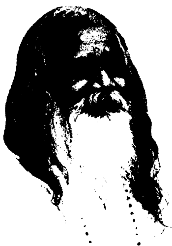
His Holiness Maharishi Mahesh Yogi

Founder of Transcendental Meditation (1957); the Science of Creative Intelligence (1971); the Maharishi Technology of the Unified Field (1982); Maharishi International University, United States (1971); Maharishi European Research University, Switzerland (1975) and Germany (1982); Maharishi University of Natural Law, England (1982); Maharishi Veda Vigyan Vidya Peeth, India [Vedic University for Asia] (1983); Maharishi Vedic University, Europe and the United States (1985); six Continental Capitals of the Age of Enlightenment (1985); the World Government of the Age of Enlightenment, a non-political, non-religious global organization with sovereignty in the domain of consciousness, authority in the invincible power of natural law, and activity in purifying world consciousness with the participation of the people of over 120 countries (1976); World Federation of Ayurveda (1985); Maharishi's World Plan for Perfect Health (1985).