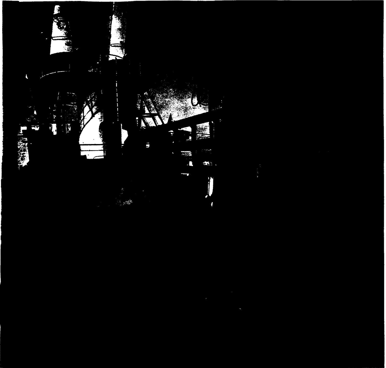
viet freighter at Cienfuegos, 20 days by sea from the Black Sea port of Odessa. Automated loading equipment has replaced stevedores lugging 250-pound sacks.

cigars, which are more a symbol of good living than a major export.