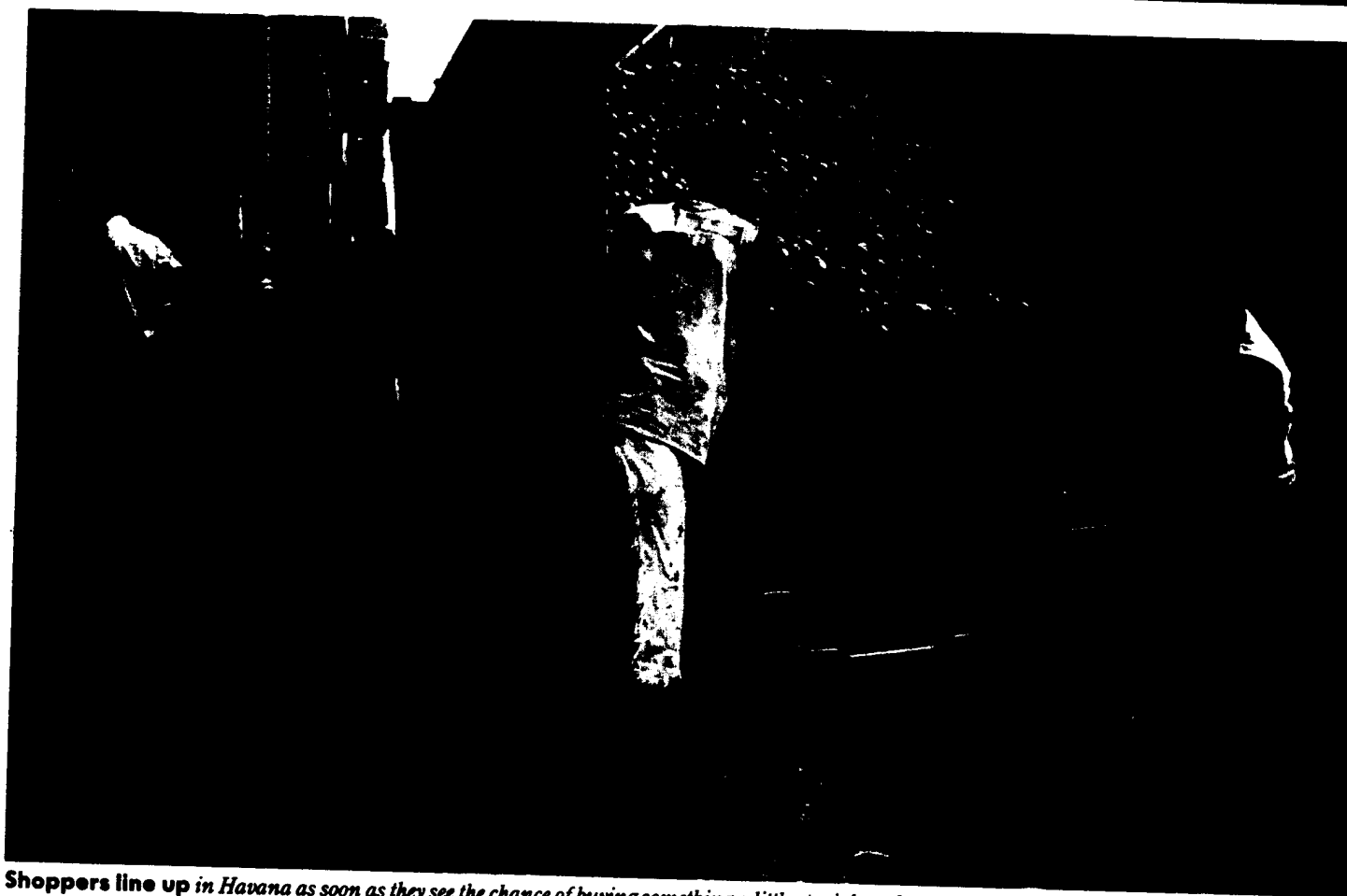
Shoppers line up in Havana as soon as they see the chance of buying something a little special, such as this truckload of oranges.

that Peru will limit debt payments to 10% of exports. Still, many bankers fear that political pressures at home will eventually force Latin America's debtor nations to back off from their commitments, which are regularly renegotiated anyway. In July, Castro called an international conference in Havana on the debt situation, but few heavyweight officials from the hemisphere turned up.