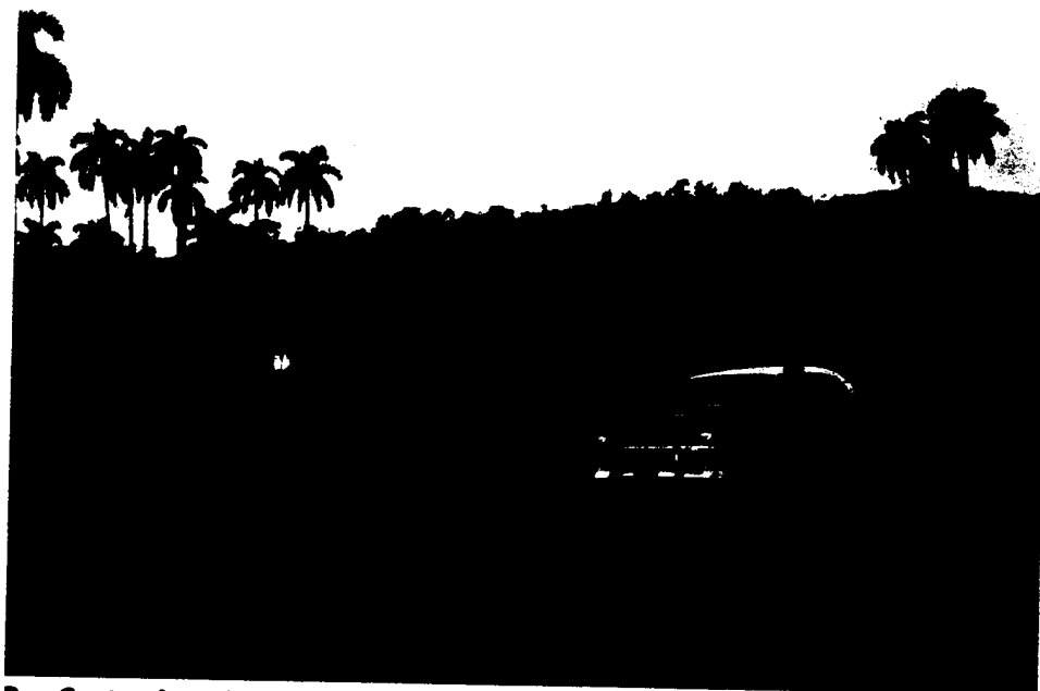
Pre-Castro American cars still provide much of the transport in the Cuban countryside.

T HE STORES have little to display. When something special comes along—a shipment of good beer, perfume, jeans—a line forms and remains until the store sells out. On the main square in the industrial city of Holguín recently, a batch of Cuban-made jeans went on sale in a parallel store for $56 a pair. In their eagerness, shoppers cracked a display window. They carried off as many as a dozen pairs each. At the normal prices of $75 for