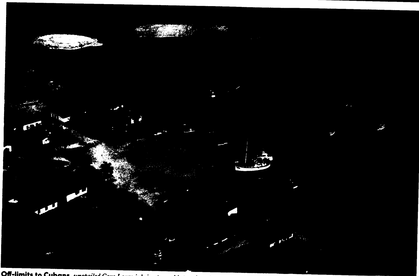
Off-limits to Cubans, unspoiled Cayo Largo is being turned into a duty-free, visa-free resort for foreign tourists with hard currencies to spend.

sulted. Cuba has had some success by establishing scores of shadowy trading companies to get around the embargo, find crucial imports quickly, and gather intelligence. The biggest of the trading companies, Cimex, based in Panama, probably grosses less than $100 million a year.