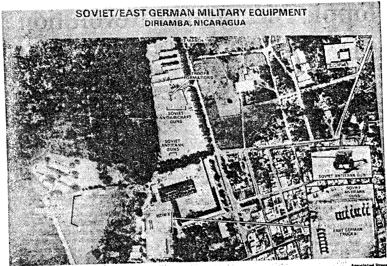
Blowup of aerial reconnaissance photograph used in supporting Reagan administration charge of military buildup in Nicaragua.

On Capitol Hill, Sen. Mark O. Hatfield (R-Ore.) joined the ranks of Reagan's critics by announcing that he will ask Congress to halt the "mad course" toward a Vietnam-type involvement in El Salvador. But Sen. Steve Symms of Idaho and five other Republican conservatives called on the Senate to reaffirm a 1962 resolution authorizing the use of any means, including military force, to halt Cuban intervention in the hemisphere.