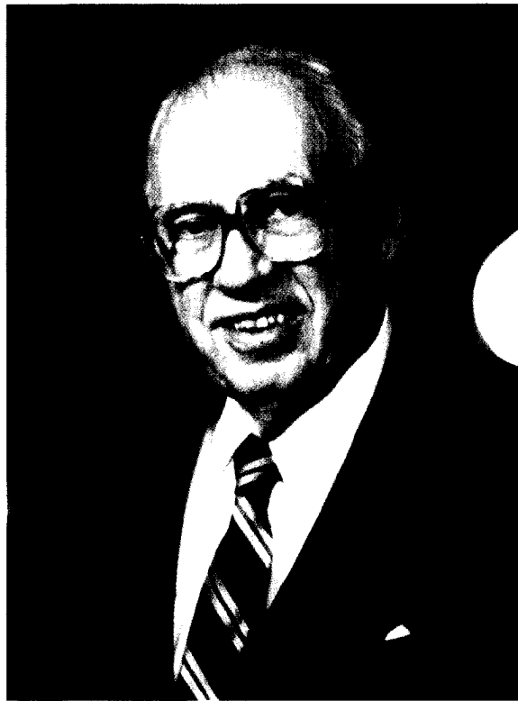
William J. Casey