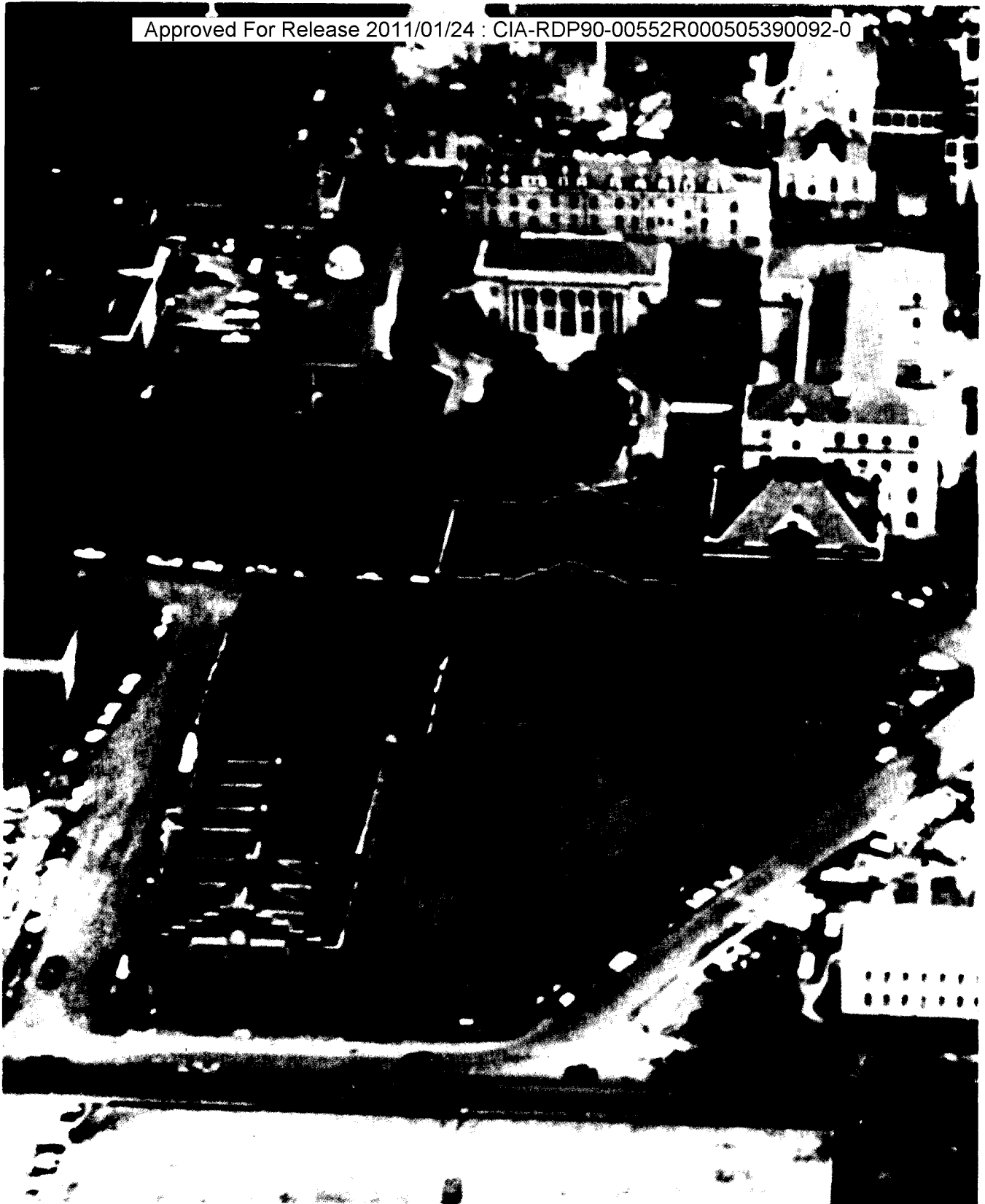
Where It All Began

Approved For Release 2011/01/24 : CIA-RDP90-00552R000505390092-0