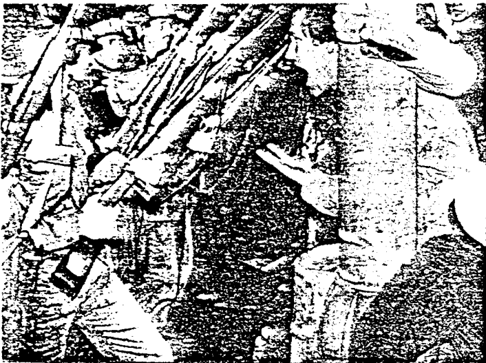
Antiwar protesters in U.S. did not become terrorists because "political system co-opted grievances, best of their leaders."

the power to solve the very problems they accuse us of causing. So they seek to influence this country and, therefore, refrain from actions that would anger Americans at home.