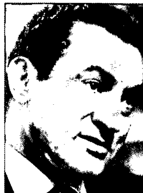
Egyptian President Mubarak