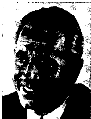
Israeli Labor Party leader Peres [redacted]