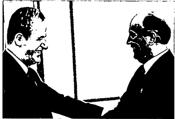
Syrian President Assad with General Secretary Gorbachev