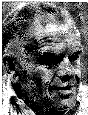
Israeli Likud Party leader Shamir [redacted]