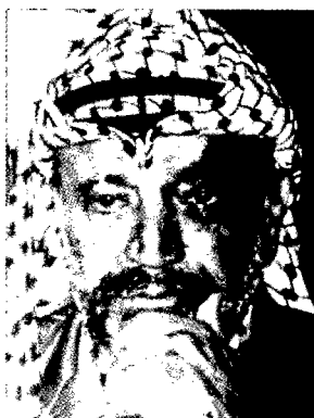
PLO leader Arafat [redacted]