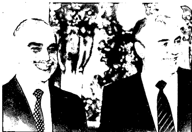
Jordan's King Hussein with General Secretary Gorbachev [redacted]

Party leader Shamir has tried to minimize the importance of any modifications in the Soviet position because he seeks to place the blame for lack of progress toward a settlement on the Arabs and their Soviet backer. He has stated, however, that he would be willing to allow Soviet involvement in Arab-Israeli negotiations if Moscow first reestablished full diplomatic relations with Israel and permitted large-scale Jewish emigration from the USSR. He also has made an effort to establish his own contacts with the Soviet Union and Eastern Europe in order to demonstrate that the Labor Party does not have any advantage on the issue of Jewish immigration. [redacted]