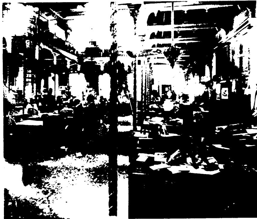
Federal postal workers, Washington, D.C., 1890s.

A number of civil servants saw things differently, however, and challenged the Hatch Act as a violation of their constitutional, First Amendment, right to participate in politics. The Supreme Court usually holds that First Amendment rights