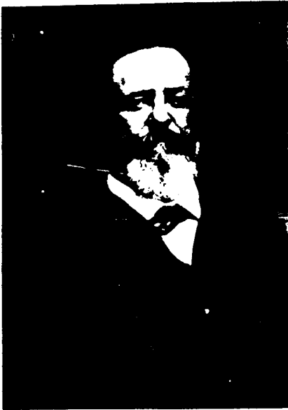
George Hunt Pendleton.

are not absolute. If the government is limiting speech for a sufficiently compelling reason, it may do so constitutionally. In the course of explaining the compelling government interest that was to be balanced against the individual civil servants' First Amendment rights, the Supreme Court provided a ringing endorsement of the Progressive theory of bureaucracy. The Court held that the government's interest in an expert, neutral, career civil service clearly separated from politics outweighed First Amendment considerations. In upholding the Hatch Act, the Supreme Court read "rotation in office" out of the Constitution.