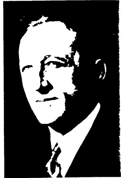
Carl A. Hatch.

Today, the most important dispute about the constitutional position of the federal bureaucracy is being fought out in cases that appear not to relate to the Constitution at all. In these cases, the parties are not claiming that a particular government action is unconstitutional but only that it is unlawful; not that it violates the