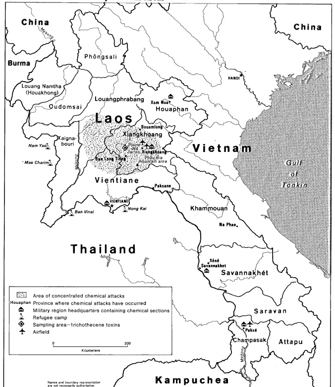
Laos: Chemical Warfare Operational Areas

The medical symptoms reportedly produced by the chemical agents are varied. According to knowledgeable physicians, the symptoms clearly point to at least three types of chemical agents—incapacitant/riot-control agents, a nerve agent, and an agent causing massive hemorrhaging. The last-named was positively identified as trichothecene toxins. This was announced publicly by Secretary Haig in September 1981. In a number of the refugee reports, eyewitnesses described attacks as consisting of "red gas" or a "yellow cloud."