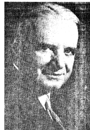
General William "Wild Bill" Donovan is the criminal credited with having dreamed up the CIA.

Now, we are going to have cures, in every case, I think. Unless there are some complicated jobs done which affect the physiology. There are dangers, there are drug insertions, where after a number of weeks the poison is released in your body automatically and you self-destruct, chemically self-destruct. There are ways in which, say pills can be inserted in the rectum, and when you get to a certain stage in your program, you make a bowel movement of a certain type, with a certain kind of psychosomatic feeling. This disgorges at least one of the two poison pills; you eat your excrement and that way you get the poison in your system. There are other ways of doing the same thing. There are sophisticated ways, if you want to get nice and mechanical — you can play around with teaching people to program their own alpha waves, and so forth. Things like that. To adjust their own blood pressure. To kill themselves by high blood pressure. All kinds of wonderful things can be done, in the name of science. But these things are not involved.