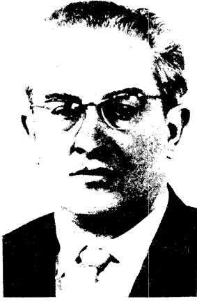
R.B. Andropov, Chairman of the Soviet KGB

"God, it can't be that. What's the matter. It's getting to me. It's impossible." That's what it was — that's exactly what it was.