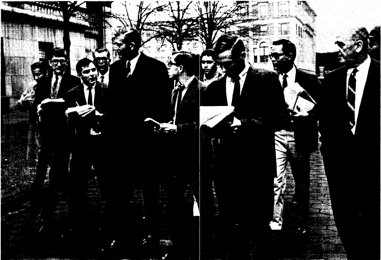
The Class of '67 had a running assignment with the Mayor of the City of New York.