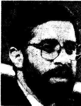
Prime Minister Musavi

One of the more visible indications of this intensified effort has been the readiness of top Iranian officials in recent months to make frequent trips