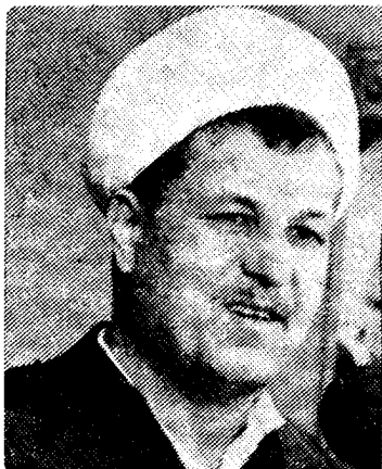
Majlis Speaker Rafsanjani

The Tehran leadership maintains that the image of Iran and its revolution abroad is distorted by the hostile propaganda of nations that fear the spread of