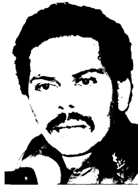
National Assembly President Nunez [Redacted]

The Sandinistas are using the National Assembly—Nicaragua's legislative body—as a rubberstamp for regime legislative initiatives and to maintain a facade of political pluralism. The Assembly has drafted a new constitution that, while honoring civil liberties in the abstract, will provide a legal basis for the restriction of opposition activities, increased state intervention in the economy, and the consolidation of power by the Sandinista National Liberation Front, the ruling party. The regime tolerates only limited opposition in the Assembly, and, despite growing frustration with Sandinista steamroller tactics, the nominally independent parties lack the leverage to force fundamental changes. [Redacted]