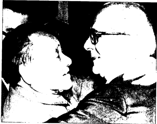
Erich Honecker and Deng Xiaoping embrace: the closer they get, the better each looks to the other.