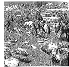
Opium is transported to the Soviet Union from the Panjsher Valley. The Panjsher Valley is a major source of opium for the Soviet Union and is a major source of opium for the Soviet Union.