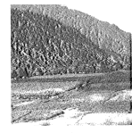
Kabul is located on a high plain and is the center of the Panjsher Valley. The Panjsher Valley is a major source of opium for the Soviet Union and is a major source of opium for the Soviet Union.