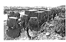
Large quantities of opium are stored in the Panjsher Valley. The Panjsher Valley is a major source of opium for the Soviet Union and is a major source of opium for the Soviet Union.