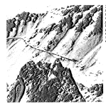
The only road (highway) between Taloqan and Kabul is the Panjsher Valley. The road is in poor condition and is often blocked by landslides and avalanches. The Panjsher Valley is a major source of opium for the Soviet Union and is a major source of opium for the Soviet Union.