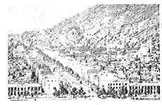
Kabul is located on a high plain and is the center of the Panjsher Valley. The Panjsher Valley is a major source of opium for the Soviet Union and is a major source of opium for the Soviet Union.