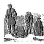
Opium is transported to the Soviet Union from the Panjsher Valley. The Panjsher Valley is a major source of opium for the Soviet Union and is a major source of opium for the Soviet Union.