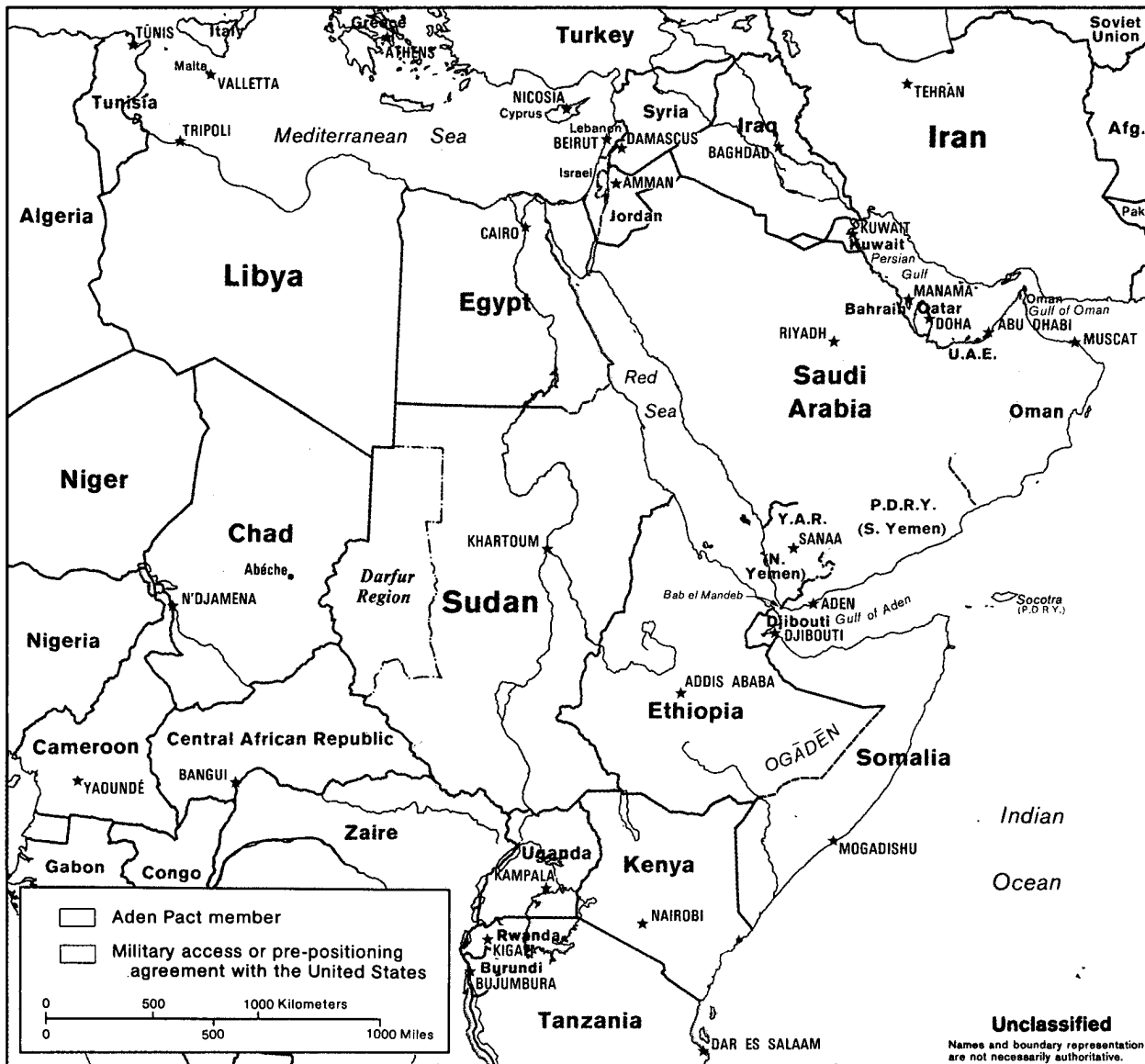
Figure 2 Aden Pact and US-Allied Countries