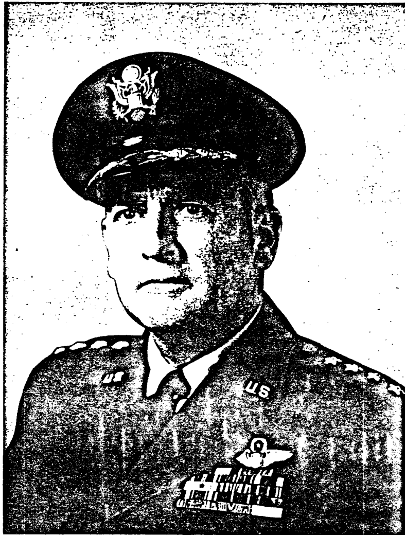
CHARLES P. CABELL Deputy Director, Central Intelligence