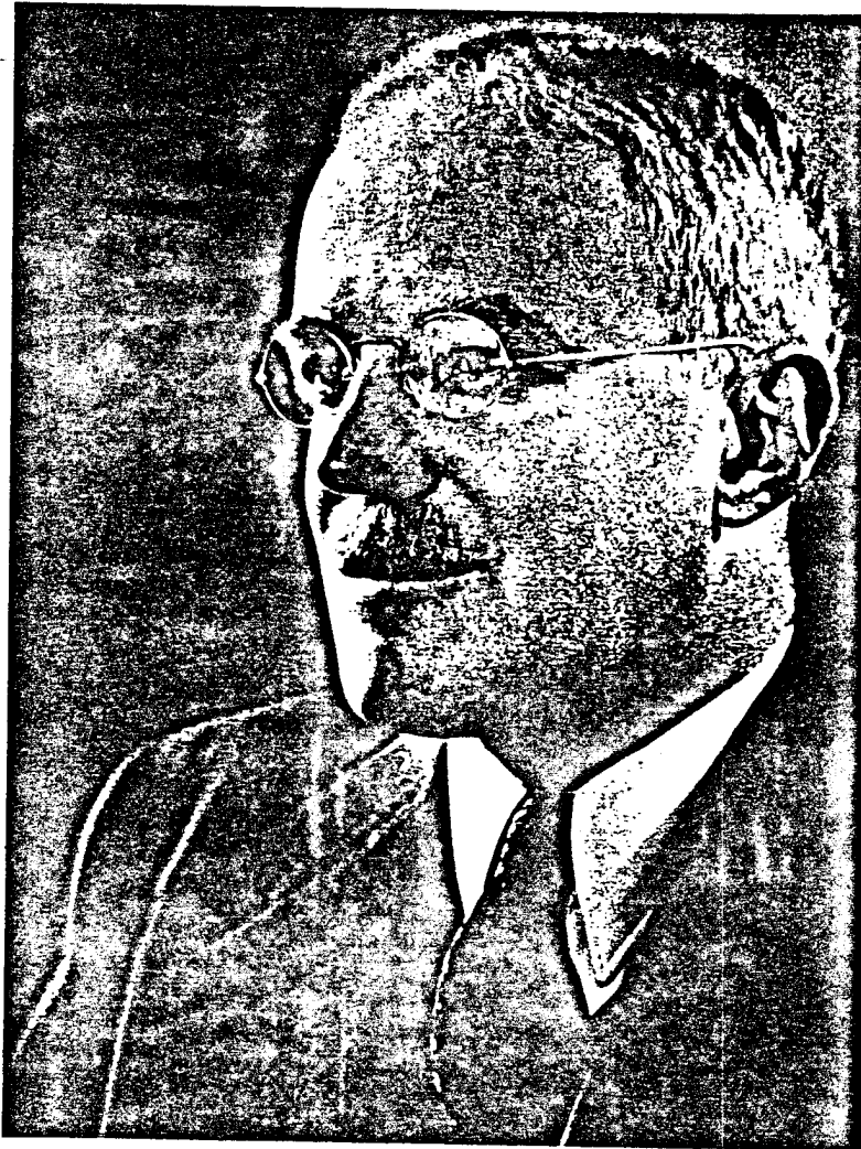
ALLEN W. DULLES Director, Central Intelligence