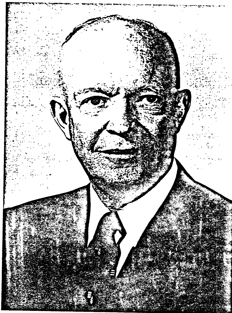
DWIGHT D. EISENHOWER President of the United States