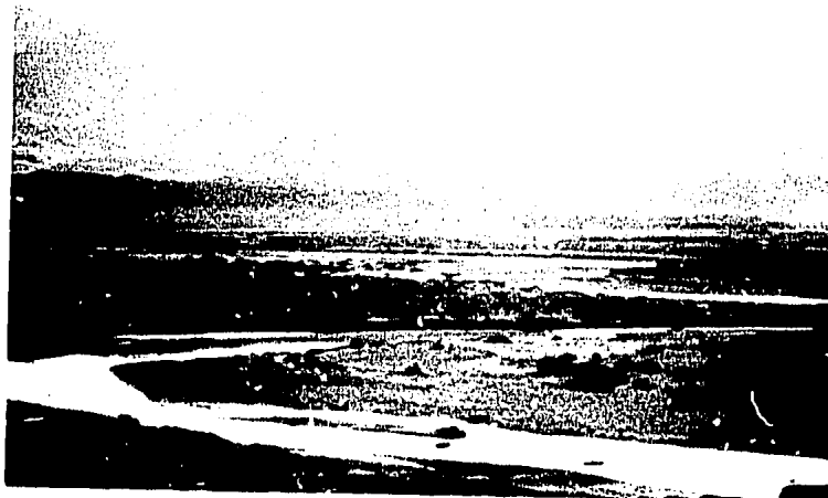
Helmand Valley Landscape