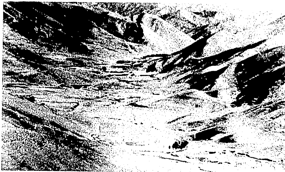
Mountain Area Near Herat

11. Lack of an adequate narcotics enforcement effort in Afghanistan has facilitated opium trafficking to Iran over the years. Afghan customs operate only two checkpoints along the 550-mile border. Local officials (mainly poorly paid police and other civil servants susceptible to bribes) actively aid and abet such trafficking. In recent years, however, Iran has tightened border surveillance. Opium seized by Iranian authorities near the Afghan border in 1970 amounted to 12.5 tons, compared with an average of only 7.2 tons in the six previous years. Iran's moves have reportedly led to a shift in border-crossing patterns away from the major routes. Also, caravans are larger and more heavily armed, and the tribesmen, aware that they are likely to be executed if they are caught in Iran, are prepared to offer resistance. Middlemen often hold smugglers' families as hostages to insure they do not surrender to Iranian border forces or fail to return with proceeds from the opium sale. Most of the opium smuggled into Iran from the South Asia region almost certainly originates in Afghanistan, and some probably also transits Afghanistan from northwest Pakistan.