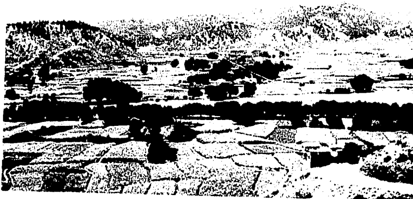
Agricultural Land Near Jalalabad

7. Except for hashish, opium earnings per hectare in Afghanistan exceed those from all other cash crops by a wide margin. Poppy fields yield an average of about 30 kgs of opium latex per hectare and prices average $10-$12 per kg, giving the farmer about $300-$360 per hectare. This contrasts sharply with gross earnings per hectare from fruit, which