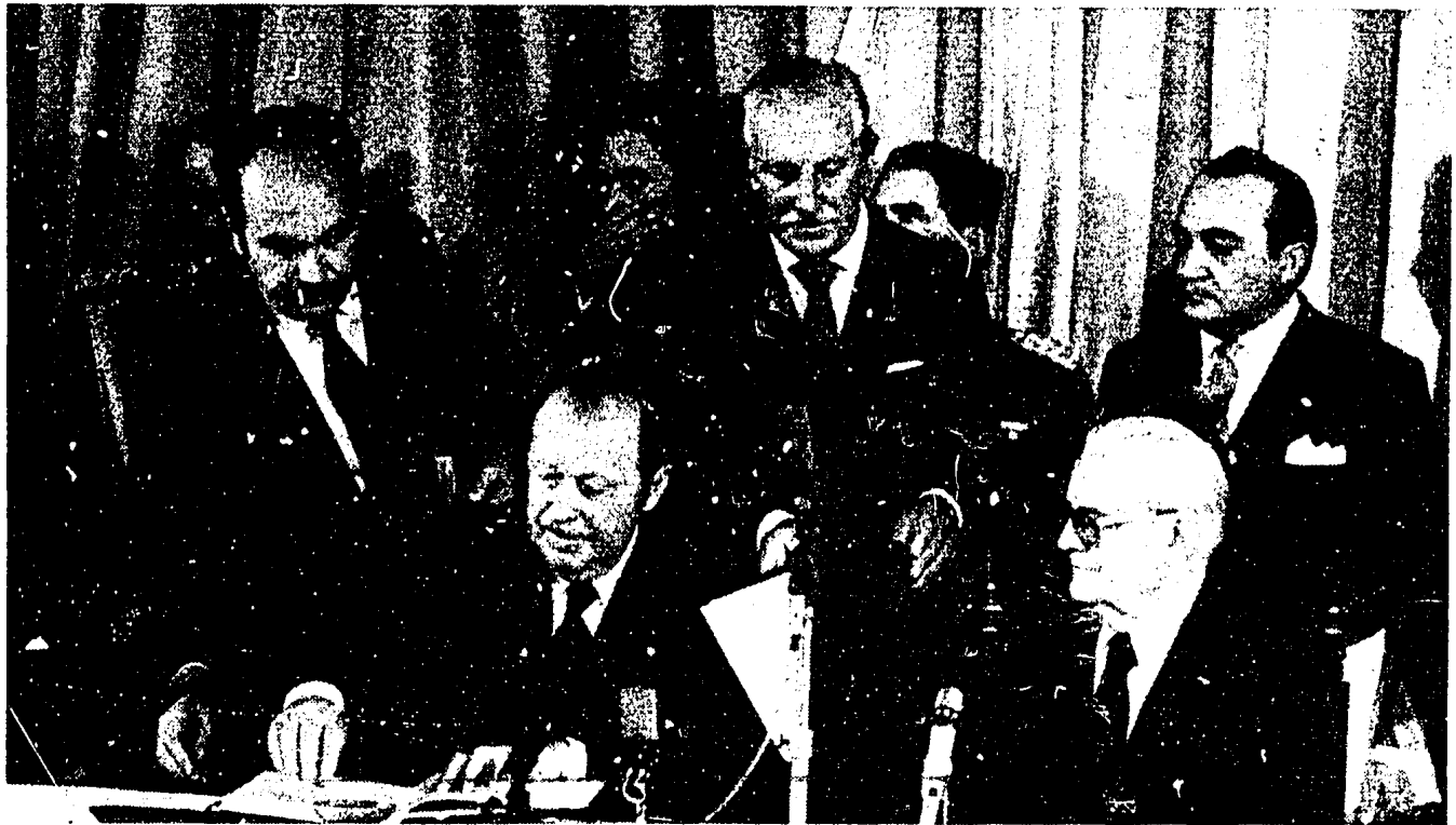
Paraguayan President Stroessner and President Geisel

In Peru, which lost territory to Chile in the same war, military leaders talk of a revenge war by the centenary in 1979.