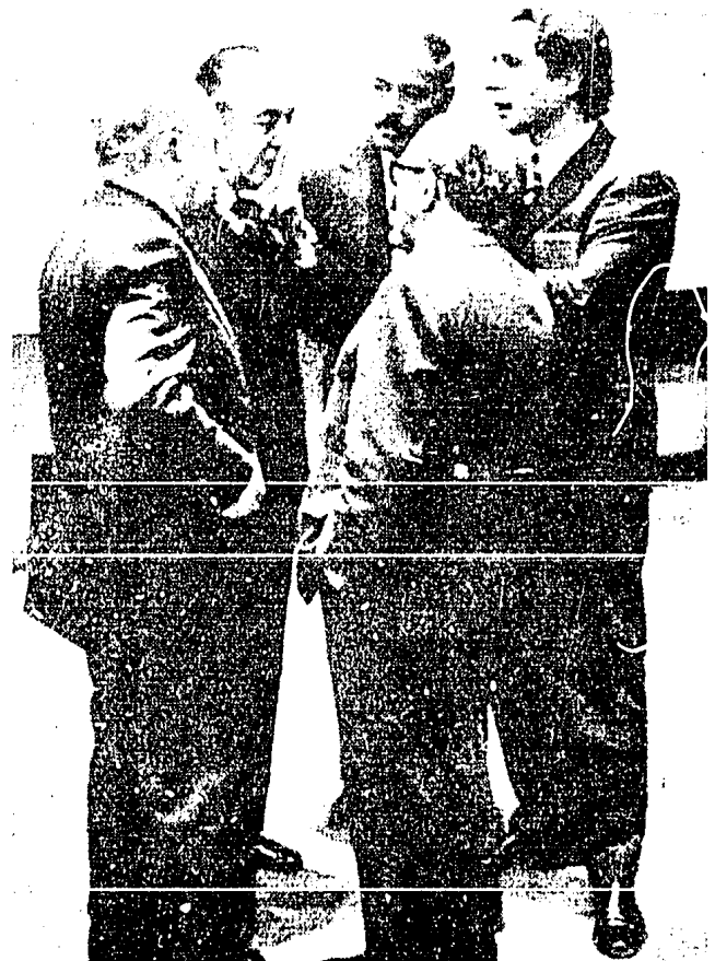
Brazilian Foreign Minister and counterparts from Argentina, Bolivia, Uruguay and Paraguay

[REDACTED] Brazil sees such assistance as instrumental in minimizing political instability in these countries, which in return has paved the way for substantial economic benefits for Brazil. In Bolivia, Brasilia secured access to large gas deposits, essential to continued growth of the Sao Paulo - based industrial complex. In Paraguay, the Brazilians gained the right to undertake an ambitious hydroelectric project that will furnish electricity to a large portion of southern Brazil. In