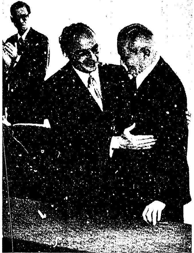
Echeverria and Geisel

many Brazilians are uneasy over their neighbor's instability—particularly the terrorism, which does not always respect national boundaries. Moreover, Brazilian leaders have no desire to see an Argentina so thoroughly frustrated by domestic confusion or feeling so encircled by pro-Brazilian regimes that it would scheme with other Spanish-speaking nations to upset the South American order and block Brazilian economic and diplomatic advances.