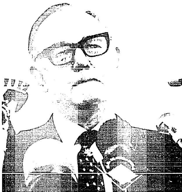
Prime Minister Vorster

Once in power, leaders of the National Party sought cooperation from English-speaking whites by emphasizing solidarity in order to maintain white supremacy. Since becoming prime minister in 1966, Vorster has tended to be relatively pragmatic in implementing apartheid. Even his