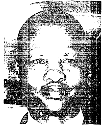
Chief Minister Matanzima