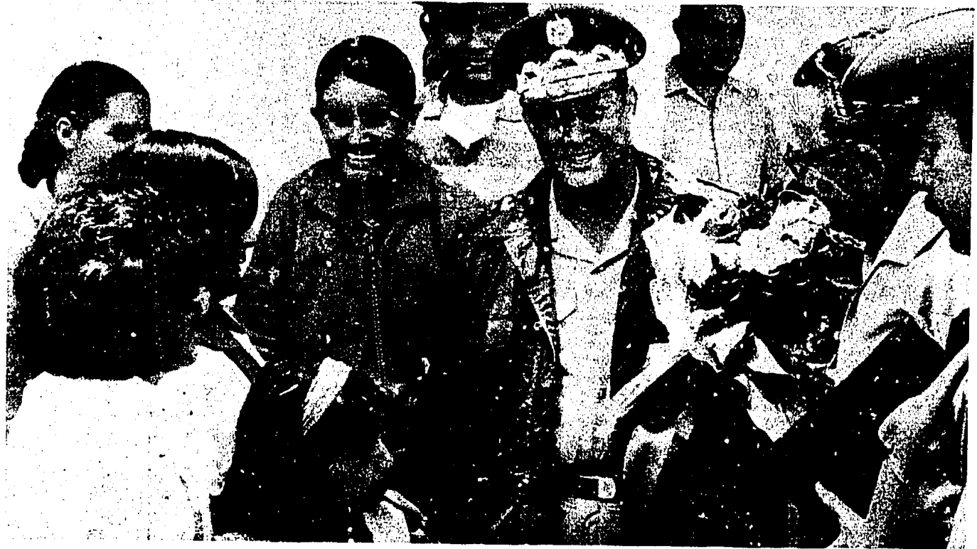
President Arana visits the countryside.

prevent an explosive buildup of discontent. On the other, his political survival depended on those who were opposed to even the most modest reforms, and he had to convince the landed gentry, businessmen, and the army that he was not working against their interests.