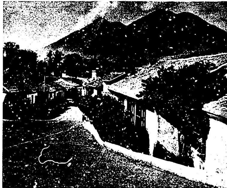
The Old ...

Arana may go down as a transitional figure in Guatemalan political history. He is a product of the army and not the oligarchy. While the Guatemalan Armed Forces lack the reformist zeal of the Peruvian military, they show a growing sympathy for the plight of the impoverished. The oligarchy tries to keep alive the dichotomy between liberacionistas and revolucionarios and to woo the soldiers away from any thought of tinkering with the country's basic socio-economic structure. Nevertheless, Arana talks of himself as one of the "people," and his reformist impulses appear to strike a responsive chord among many of the junior officers. So long as this is the case, the social, political, and cultural integration of the lower income groups into the mainstream of national life will probably keep pace with "effective demand," the rising expectations of the people. If the armed forces will not serve as the engine of progress, they will at least not be cast in the role of a caboose with its brakes on.