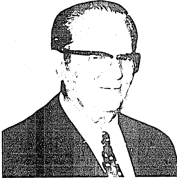
The aging, 79-year-old President Tito, whom some describe as the "first and last Yugoslav."

The need to institutionalize the succession process, rather than court chaos, has led directly to the dramatic new developments in Yugoslavia's political life. President Tito, long cognizant of the problems that will accompany the transition period after his retirement or death, over the last few years had already begun to delegate some of his once-absolute powers to trusted colleagues. He nonetheless stunned an audience in Zagreb on 21 September 1970 when he called for the creation of a collective executive body to replace his own lifetime presidency. He indicated that he was wearying of the duties of the office, looking ahead to possible retirement, and desirous of creating a collective presidency that could begin to relieve him of some of the rigors of his post.