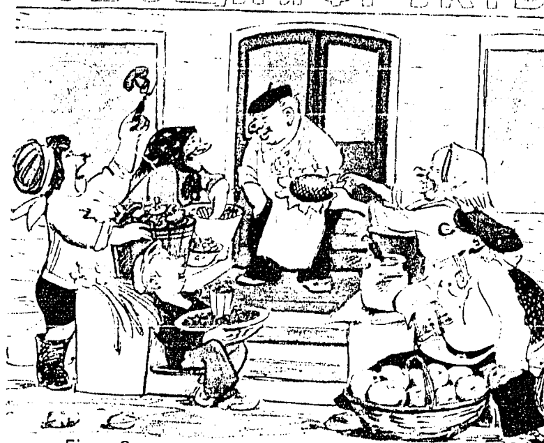
Figure 3. Мне пару малосольных огурчиков! ("How about a couple of nicely salted cucumbers!")