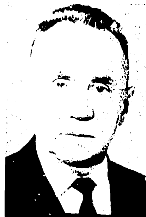
Aleksey N. Kosygin

11. Premier Kosygin suffered a slight loss of status at the congress. He dropped from second to third place, behind President Podgorny. One of the principal spokesmen for closer Soviet relations with the West, Kosygin has steadily been pushed aside as Brezhnev assumed leadership in this field. It was Kosygin who visited France in 1966 and England in 1967, and who met with President Johnson at Glassboro later that year. But in 1971 it was Brezhnev who traveled to France and met with Brandt. While Kosygin welcomed Brezhnev's support for