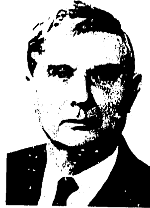
Mikhail A. Suslov

4. In late 1969 there were reliable reports that Brezhnev was under fire from Suslov, Shelepin, and Mazurov for lack of dynamism and a tendency to tread water on policy questions. His efforts to increase the cohesion of the Communist world were frustrated, and the stalemate with China persisted. The "Brezhnev doctrine" was useful to justify, after the fact, the invasion of Czechoslovakia, but was hardly the basis for a Brezhnev foreign policy. Brezhnev needed an opening for fresh initiatives, and Brandt's election as West German chancellor provided an opening in the foreign policy field. Seizing on it, Brezhnev used the tactic that had served him in the past--adopting the platform of his critics while undercutting their political positions. In the following months, a new, activist Brezhnev began to emerge.