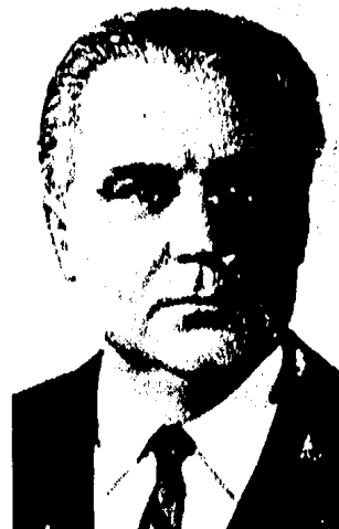
Vladimir V. Shcherbitsky

31. The split between Shelest and Shcherbitsky, the latter a proxy for Brezhnev, was much in evidence at the congress. Scherbitsky stressed that the labor of all the Soviet people formed the basis of Ukrainian success, and added that "great credit" was due to those in Moscow who were unflinching in their concern for all the republics. Shelest's speech, in contrast, contained no word of thanks to the Great Russians. Instead, he insisted that the shoe was on the other foot--that the Ukraine was responsible for a great part of the nation's production. Shelest was joined in this stance by the same republic party bosses who before the congress had shown the greatest reluctance to praise Brezhnev personally.