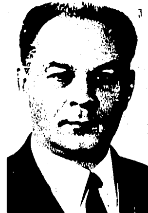
Aleksandr N. Shelepin

1. In the early days of the collective leadership, the principal challenge to Brezhnev came from the ambitious Shelepin who spoke for neo-Stalinism and rode the wave of reaction against Khrushchev. Brezhnev, in classic political style, moved with the flow of conservatism to limit the ground available to Shelepin, at the same time undermining Shelepin's political base. By late 1967, Brezhnev had control over the conservative wing of the party, and Shelepin had been reduced to the politically powerless post of trade unions chief.