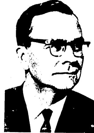
Gennady I. Voronov

capital investments in the agricultural sector. He vigorously campaigned for the adoption of the controversial "link" system of organizing farm labor, a system that, to the ideologically orthodox, smacks of private farming.