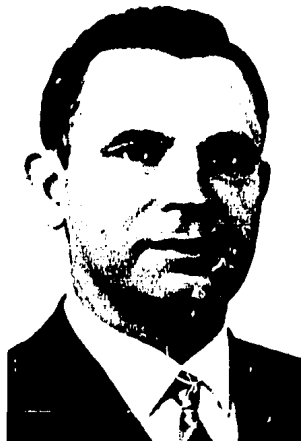
Dmitri S. Polyansky

21. Brezhnev can take comfort in the fact that most of the important spokesmen for conservative causes had either been removed from office before the detente policy got under way or were sufficiently beholden to him politically to ensure their compliance. One influential foreign-policy conservative, Leningrad party boss Tolstikov, was maneuvered out of the country as ambassador to Peking before the 24th party congress. His successor appears to be somewhat more open to Brezhnev's blandishments, and as a "new boy" carries considerably less weight than had Tolstikov.