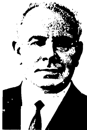
Nikolay V. Podgorny

12. Not only has Brezhnev encroached on Kosygin, but Brezhnev also has helped his political ally, President Podgorny, to do likewise. The last-minute inclusion of Brezhnev and Podgorny in what were originally scheduled as private talks between Kosygin and Mrs. Gandhi had every appearance of a deliberate elbowing in on Kosygin. The premier has had a special interest in relations with India, at least since the Tashkent Conference in 1966.