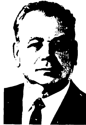
Andrey P. Kirilenko

39. With Brezhnev at the ceremony were the "Moscow Ukrainians," Podgorny, Kirilenko and Polyansky--the last two being prime beneficiaries of Voronov's removal. Those leaders who would seem to have had the most to lose from Voronov's political demise and who probably opposed his ouster--Kosygin, Suslov, and Shelepin--were absent, perhaps as a deliberate gesture to dissociate themselves. Moreover, rumors began once again to circulate about Kosygin's impending retirement, due to "ill health." It is true that Kosygin has health problems of long standing. They do not, however, seem to be of an incapacitating nature thus far. Rumors of his retirement because of poor health, which recur sporadically have not coincided with any of the identifiable periods where the Premier was ill and seem to be less a reflection of any such intention on Kosygin's part than a symptom of temporary political weakness. They may have been started by others in the leadership eager to see him go.