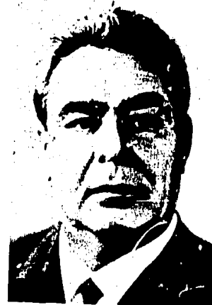
Leonid I. Brezhnev

To some extent Brezhnev simply has taken advantage of events at home and reacted to developments elsewhere. As the prevailing view has shifted within the Soviet leadership, particularly in foreign affairs, Brezhnev, a perennial middle-grounder, has moved with the tide. But Brezhnev is first and foremost a politician, and in the past year he has taken the lead in assuming public responsibility for controversial policies. His colleagues probably recognize that Soviet interests abroad are best served when there is one undisputed leader able to speak with full authority.