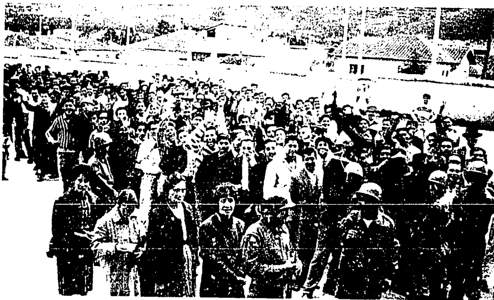
National Elections in Ecuador

18. Under the plan announced last June, elections will be held for president, vice president, and congress in June 1972. At the same time, voters will choose between the 1946 constitution, and a new constitution to be written by the incoming congress. President Velasco favors the 1946 document, because it was drafted under his direction during the second of his four earlier terms and gives