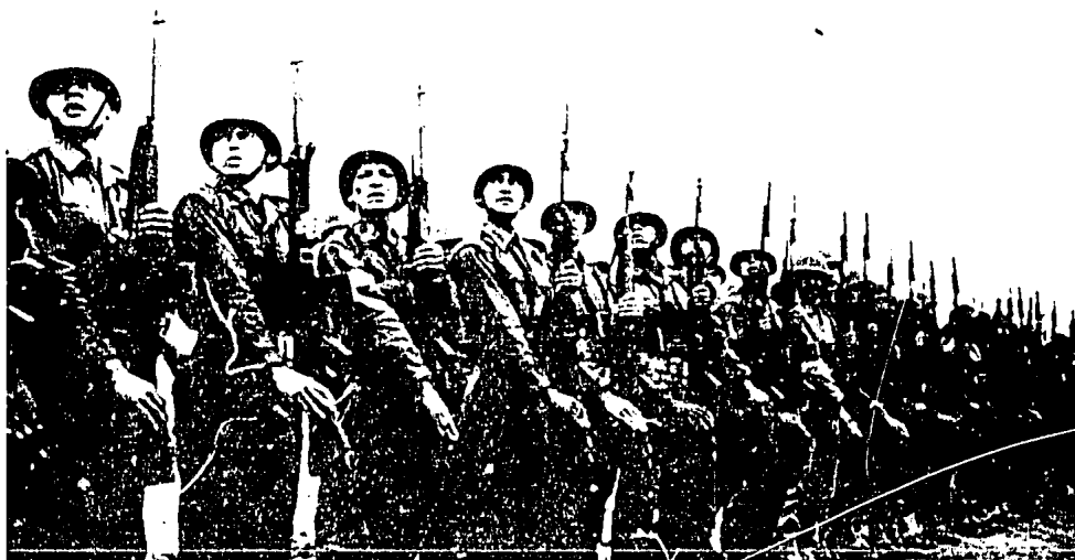
Soldiers of the Ecuadorean Army

6. The armed forces, now as always the ultimate arbiters of politics in Ecuador, backed Velasco when he assumed dictatorial powers in June 1970. This step was taken because of student disorders and an unfavorable decision by the Supreme Court