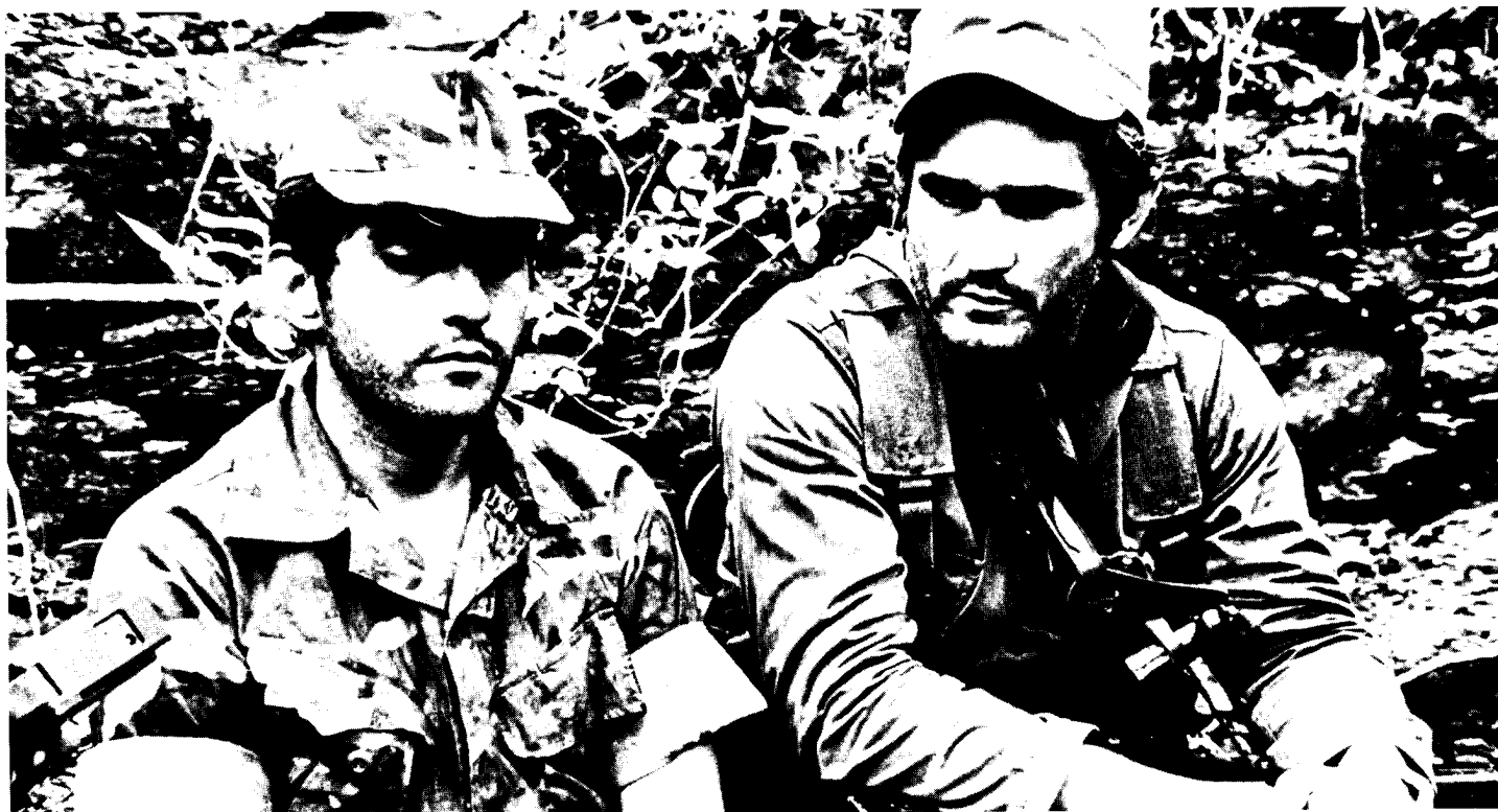
A hero in the 1979 revolution, Edén Pastora, known as Commander Zero, resigned as Deputy Defense Minister of the new government and formed an organization that opposes the current Sandinista Junta.