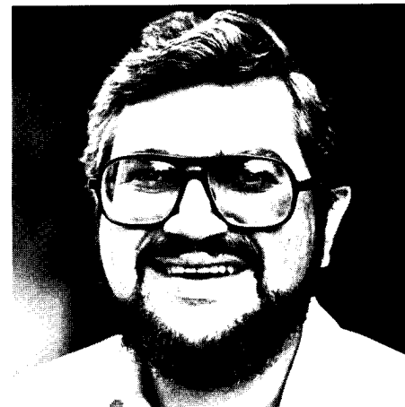
Alfonso Robelo, former Junta member, resigned after nine months with the Sandinista Directorate, and has announced his support for Pastora (Commander Zero)

MDN head Alfonso Robelo had to flee the country in the spring of 1982. He