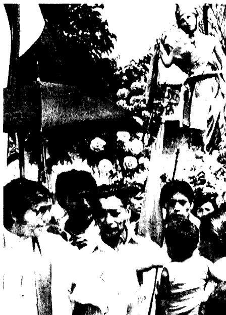
Crowds attend a religious procession in Masaya, where violent protests in 1982 between anti-Sandinista groups and government supporters over incarceration of a priest, left several persons dead and injured.

Nineteen were deported; security forces killed one "while attempting to escape," according to the Ministry of Interior.