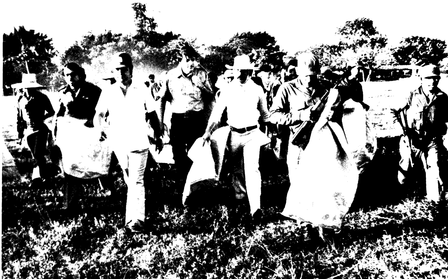
Two members of the Nicaragua Junta, Daniel Ortega (second from left) and Sergio Ramirez (fourth from left) join cotton pickers in Leon. The regime's mismanagement of agriculture has resulted in plummeting harvests.

If the Sandinistas have displayed malice in their policies toward private