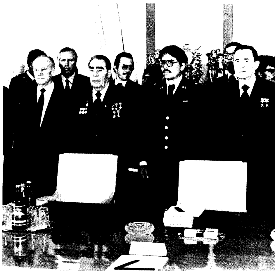
Fidel Castro (opposite page, third from left) accompanied by Daniel Ortega and members of the Junta, arrives in Nicaragua for celebration of first year of Sandinista rule.