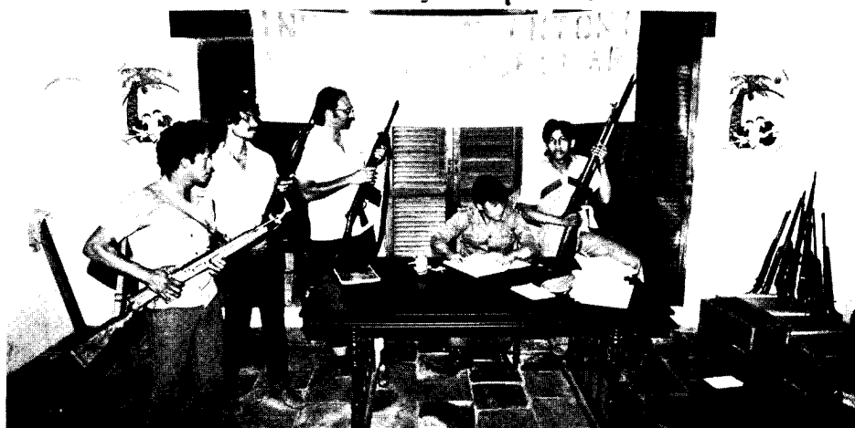
Parade of tanks (top) rolls by a crowd during celebration of first anniversary of victory over Somoza. Nicaragua's rapidly expanding military buildup threatens its neighbors. Among the latest additions to the army's inventory: heavy Soviet T-55 tanks.