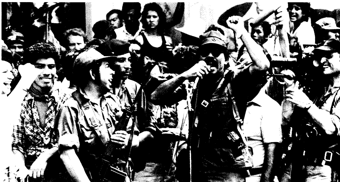
Daniel Ortega (at microphone), one of the leading members of the Sandinista Directorate, speaks to a gathering shortly after victory over the Somoza regime in 1979.