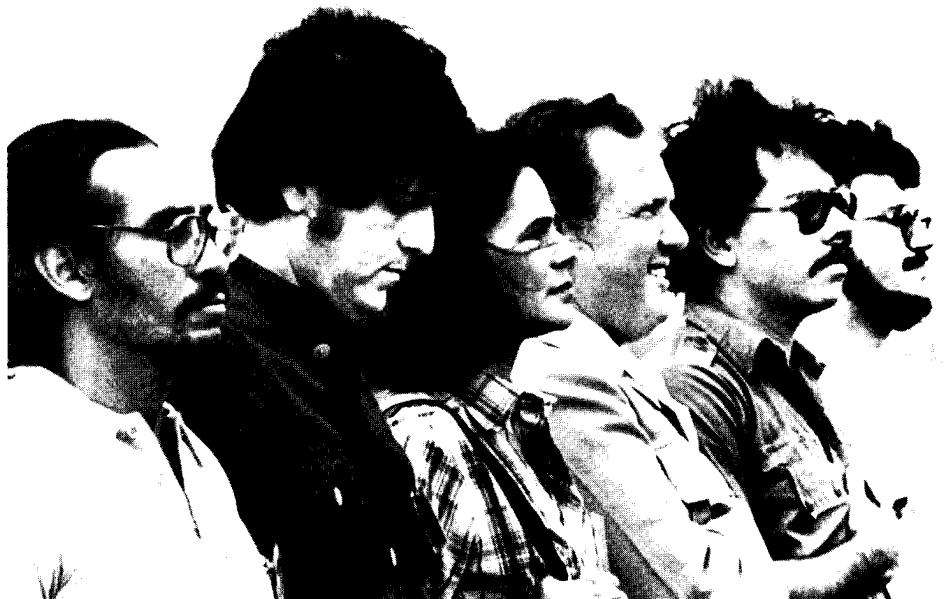
The Nicaraguan Junta with Costa Rican President Rodrigo Carazo Odio in 1979. From left to right: Moises Hassan, Sergio Ramirez, Violeta de Chamorro, President Carazo, Daniel Ortega and Alfonso Robelo Chamorro and Robelo, both non-Marxists, resigned in 1980.