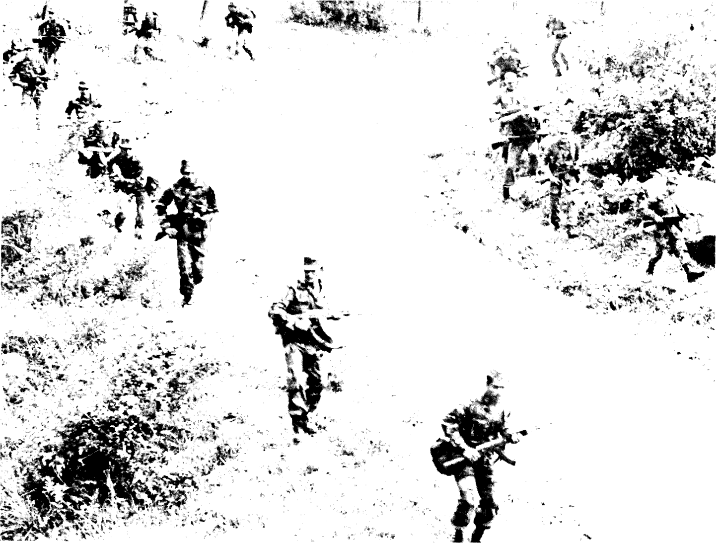
Sandinista soldiers on training maneuvers near the Honduran border

One of the reasons why some political leaders in Honduras and Costa Rica have hesitated to oppose Nicaragua and to organize their defenses is that they are concerned about the international political and intellectual forces that Nicaragua might bring to bear against them. But if Nicaragua is