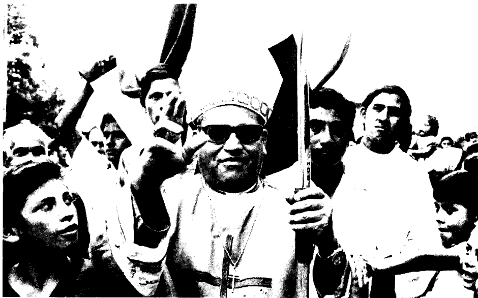
Archbishop Obando y Bravo greets some of his parishioners following a mass honoring heroes of the revolution. A long-time foe of Somoza, he has suffered from Sandinista violence.

Most of the Protestant churches also have become disillusioned with the Sandinistas after initially supporting the revolution. In March 1980, the government arrested 20 Jehovah's Witness missionaries from the United States, Canada, Britain and Germany.