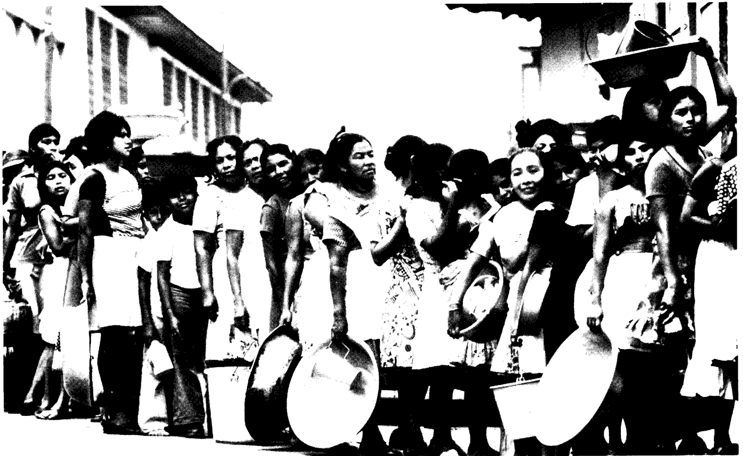
In 1979 shortages forced people to stand in long lines for food, as here in Masaya. Today, three years after the revolution, failing economy continues to plague the country.