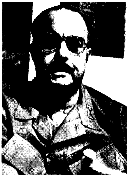
Anastasio Somoza, ousted dictator of Nicaragua

Since the Marxist-Leninist minority had most of the top positions from the beginning, the "struggle for power" was never a close contest. Arturo Cruz, who was a member of the