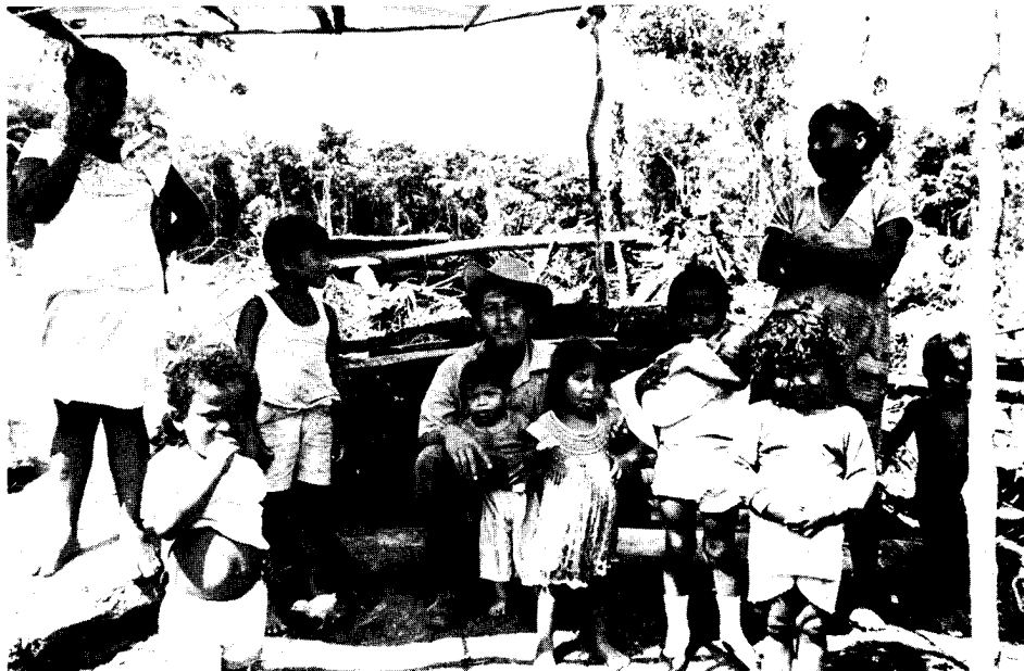
Miskito Indians, displaced by the Sandinistas, are forced to live in "resettlement" camps which they are not permitted to leave. Miskitos were given six hours to gather their personal effects and leave their homes. After an eight day walk, they arrived at camps such as this. Rather than accept Marxist-Leninist doctrine and live in what amount to detention facilities, many Miskitos have sought refuge in Honduras. Because of their resistance to the Sandinistas, some Miskitos have been tortured or killed.