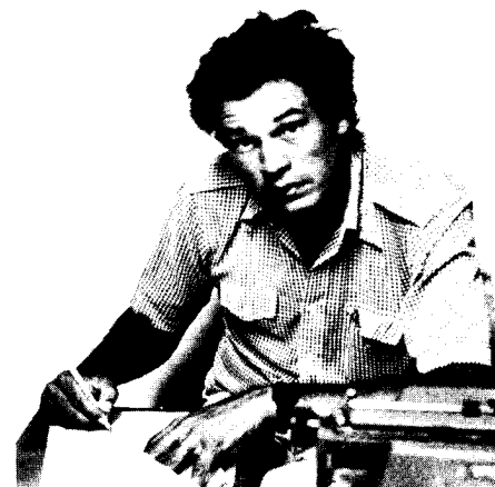
Past and present editors of La Prensa . Pedro Joaquin Chamorro, Sr. (left), an outspoken critic of the Somoza regime, was assassinated by an unknown gunman in 1978. Chamorro's son, Pedro (right), took over as editor. Pedro Chamorro, Jr., has endured even worse censorship and harassment than his father as a result of the paper's independent, often critical stance toward the regime in power.