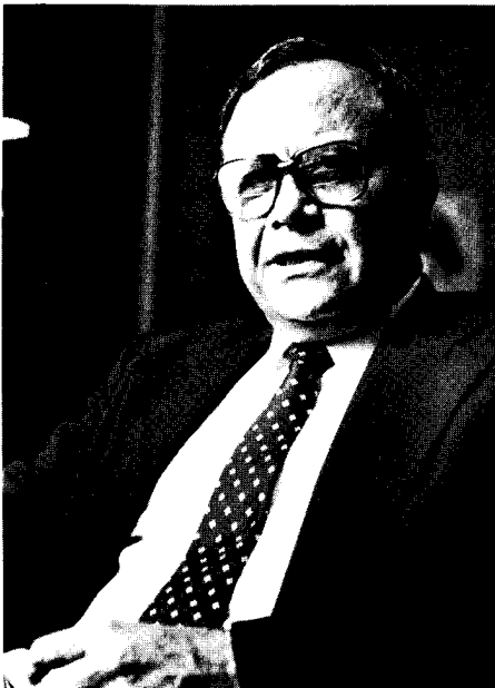
Arturo Cruz, a former member of the Junta, was disillusioned with the Sandinistas but continued in the revolutionary government until 1982, when he resigned as Ambassador to Washington

Marxism-Leninism is the scientific doctrine that guides our revolution, our vanguard's analytical tool for...carrying out the revolution....We cannot be Marxist-Leninist without Sandinism, and without Marxism-Leninism Sandinism cannot be revolutionary. Thus, they are indissolubly linked....Our political strength is Sandinism and our doctrine is Marxism-Leninism.