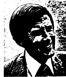
Dan R. Coats of Fort Wayne (4th Dist.) Republican—Jan. 20, 1981 b. May 16, 1943—Businessman

Assistant Vice President Mutual Security Life Insurance Co. Board president of the Fort Wayne Chapter of Big Brothers/Big Sisters. B.A. Wheaton College; J.D. Indiana University. Married, three children.