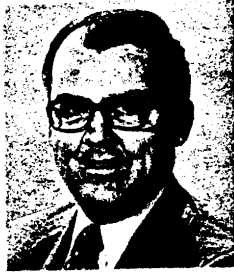
Norman D. Shumway of Stockton (14th Dist.) Republican—Jan. 15, 1979 b. July 28, 1944—Politician

Dist. resources, pop. —Live-stock and poultry; electrical machinery, equipment, and supplies. communication equipment: 466,008 618,770