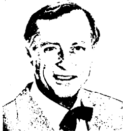
Lawrence Coughlin of Villanova (13th Dist.) Republican—8th term b. April 11, 1929—Lawyer

Yale U., B.A., 1950; Harvard, M.B.A., 1954; Temple U. Evening Law School. LL.B., 1958; USMC. Korean War; Pa. Legislature, 1965-66; Pa. Senate, 1967-68. Episcopalian, married, four children. Dist. resources, pop.— Fabricated metal; chemicals; drugs, plastics materials, synthetic resins, rubber; primary metal industries, blast furnaces, steel works, rolling. 457,616