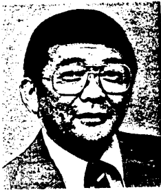
Norman Y. Mineta of San Jose (13th Dist.) Democrat—5th term

Univ. of Calif., B.S., 1953. Army Intelligence, '53-56. Proprietor Mineta Ins. Agcy.; Vice Mayor, 1968-71 and Mayor, City of San Jose, 1971. Japanese-American Cit. League. Married, 2 children.