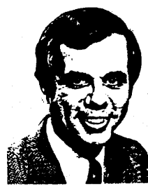
Tony Coelho of Merced (15th Dist.) Democrat—Jan. 15, 1979 b. June 15, 1942—Politician

Dist. resources, pop. —Live-stock, dairy, and poultry; food and kindred products, concrete products, flat glass; nonelectrical machinery; 510,653.