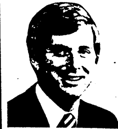
Sen. Dan Quayle of Huntington Republican—Jan. 20, 1981 b. Feb. 4, 1947—Lawyer

Legislature Senate: 60 members elected for 4 years. House of Representatives: 100 members elected for 2 years.