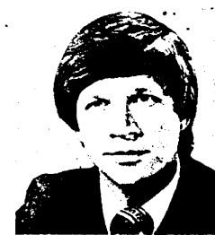
John R. Kasich of Westerville (12th Dist.) Republican—1st term b. April 18, 1927—Lawyer

Former practicing attorney, partner, firm of Feibel, Feibel, Shamansky and Rogovin. Received B.A. degree from Ohio State University and J.D. from Harvard University. Married.