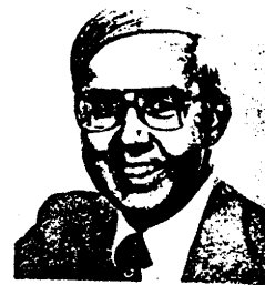
Robert S. Walker of East Petersburg (16th Dist.) Republican—4th term b. Dec. 23, 1942—Educator

B.S., Lehigh University; M.S. and Sc.D., Mass. Institute of Technology. Manager of Research Development Program, Lehigh University. Married, 2 children. Dist. resources, pop.— Apparel and other finished products made from fabrics, similar materials; electrical machinery, equipment, and supplies; textile mill products, knitting mills; tourism (Poconos); 499,000