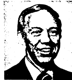
James L. Oberstar of Chisholm (8th Dist.) Democrat—Jan. 3, 1975 b. Sept. 10, 1934—Pub. Serv.

Col. of St. Thomas, B.A. (Summa Cum Laude); Col. of Europe, Burges, Belgium, M.A. Adm. Asst. U.S. House Committee on Public Works; Adm. Asst. to Rep. John A. Blatnik. Married, 3 children.