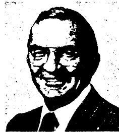
Arlan Stangeland of Barnesville (7th Dist.) Republican—March 1, 1977 b. Feb. 8, 1930—Farmer

Member Minnesota State Legislature for about eight years, Director, Barnesville Chamber of Commerce and member Barnesville School Board. Deacon, Church Board. Lutheran, married, 7 children.