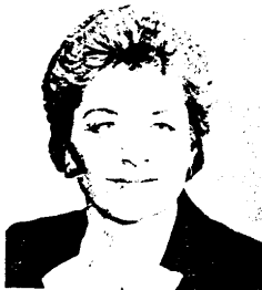
Marcy Kaptur of Toledo (9th Dist.) Democrat—1st term

Marcy Kaptur, 36, is a self-employed development consultant. From 1979 to 1981, Ms. Kaptur was employed by the National Consumer Cooperative Bank as deputy secretary for policy, research and development. From 1977 to 1979, she worked in the Carter White House as Assistant Director for Urban Affairs. pop.— Nonelectrical, general industrial machinery; fabricated metal products, stampings; nonferrous foundries; stone, clay,