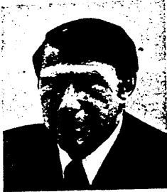
Martin O. Sabo of Minneapolis (5th Dist.) Democrat—Jan. 15, 1979 b. Feb. 28, 1938—Politician

Mr. Sabo was elected to the Minnesota State House of Representatives in 1960 at the age of 22, as the youngest Legislator in the 1961. He was House Minority Leader in 1969 and 1971 and was elected Speaker of the Minnesota House of Representatives for the last three sessions. Married, 2 children.