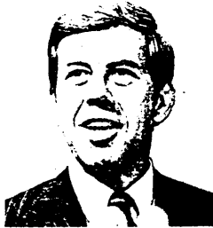
Sen. Richard G. Lugar of Indianapolis Republican—Jan. 3, 1977 b. Apr. 4, 1932—Businessman

B.A., 1954, Denison Univ.; B.A. and M.A., 1956, Pembroke College, Oxford (Rhodes Scholar); Business Executive; Mayor of the City of Indianapolis, 1968-75; President, National League of Cities Advisory Board. Methodist, married.