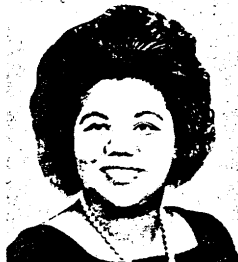
Katie Hall of Gary (1st Dist.)

Lawyer, newspaper executive and member U.S. House of Representatives 1974-80. He served as a U.S. observer at the SALT nuclear-arms talks. B.A. DePauw University, 1969; J.D. Indiana University, 1974. Publisher Huntington Herald Press.