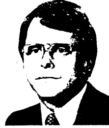
Richard M. DeWine of Cedarville (7th Dist.)

Mike DeWine, 35, is a lifelong resident of Greene County. He received a degree in education from the University of Miami at Ohio, and later earned his law degree at Ohio Northern. After serving as assistant county prosecutor from 1972 to 1975, Mr. DeWine was elected prosecuting attorney and held this post until 1980. He currently is serving his first term in the Ohio State Senate. His committee assignments include Ways and Means, for which he is vice chairman, Agriculture, and En-