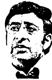
Leon E. Panetta of Carmel Valley (16th Dist.) Democrat—Jan. 3, 1977 b. June 28, 1938—Lawyer

Dist. resources, pop. —Cotton and dairy; canned and preserved fruits, vegetables; nonelectrical machinery, office, computing, accounting 578,064