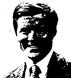
Doug Walgren of Pittsburgh (18th Dist.) Democrat—Jan. 3, 1977 b. Dec. 28, 1940—Lawyer

George Gekas, 52, is an attorney and Pennsylvania State Senator. After earning both his undergraduate and law degrees from Dickinson College, he spent two years in the Army. Mr. Gekas began his extensive political career in 1960 as assistant district attorney of Dauphin County, a post he held for six years. In 1966, he was elected to the Pennsylvania House of Representatives, where he served four terms before his election to the State Senate in 1976. Senator Gekas, currently serving a second term in the Senat