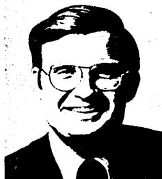
Philip R. Sharp of Muncie (2d Dist.) Democrat—5th term

DePauw Univ.; Graduated from Georgetown Univ. School of Foreign Service, 1973; Oxford Univ. Ph.D. Prof. Ball Univ., 1969-74, Aide to Senator Vance Hartke of Indiana. Married, no children.