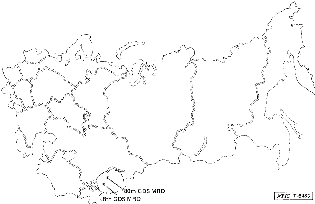
FIGURE 1. 17TH ARMY CORPS AREA, CENTRAL ASIAN MILITARY DISTRICT, USSR