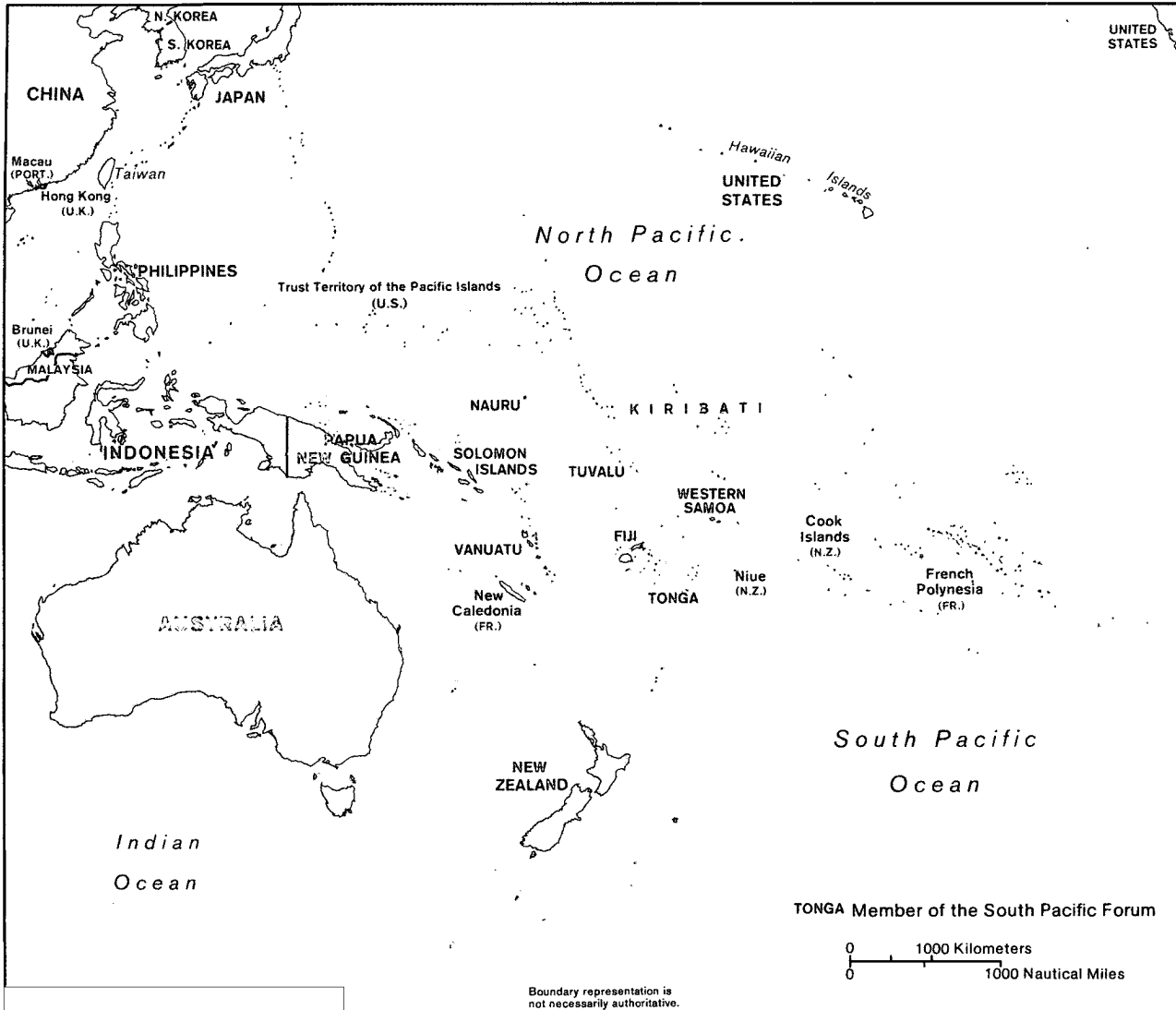
Figure 1 South Pacific Forum Members