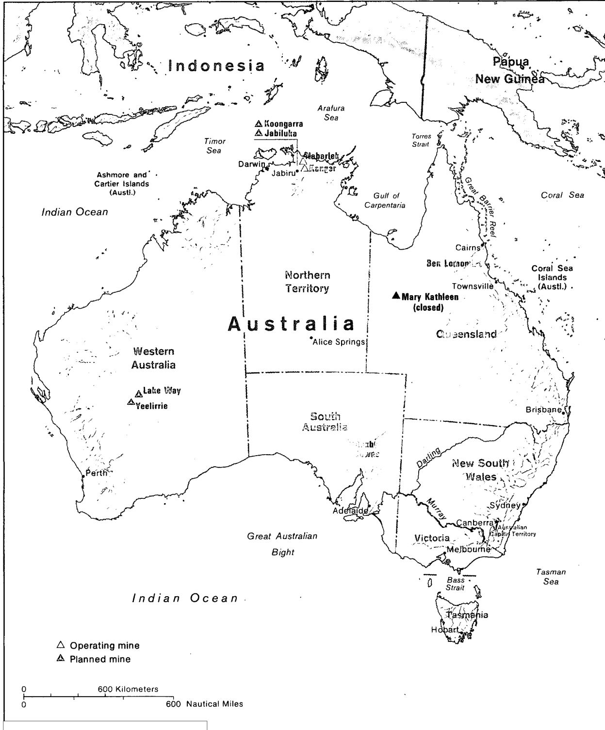
Figure 2 Uranium Mines