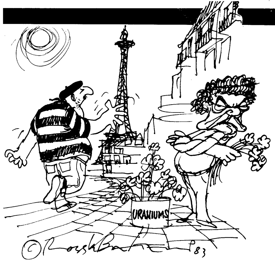
"Keep zem. I go zomewhere elze."

Nonetheless, considering the vehemence of minority opposition to uranium production, a government decision that falls short of shutting down the industry seems certain to ensure prolonged and high-pitched attacks by the diehard opposition. [redacted]