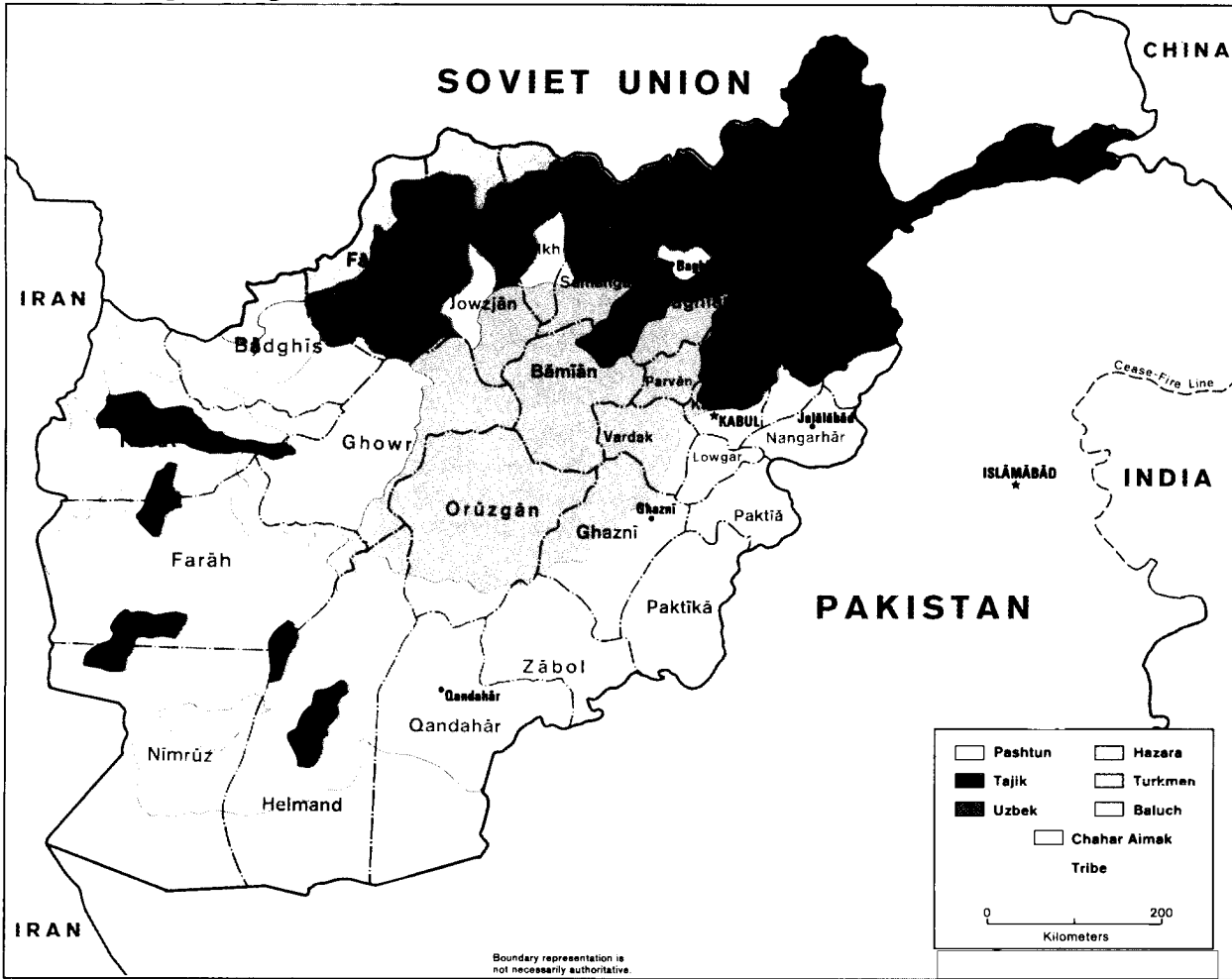
Figure 4 Ethnic Groups in Afghanistan