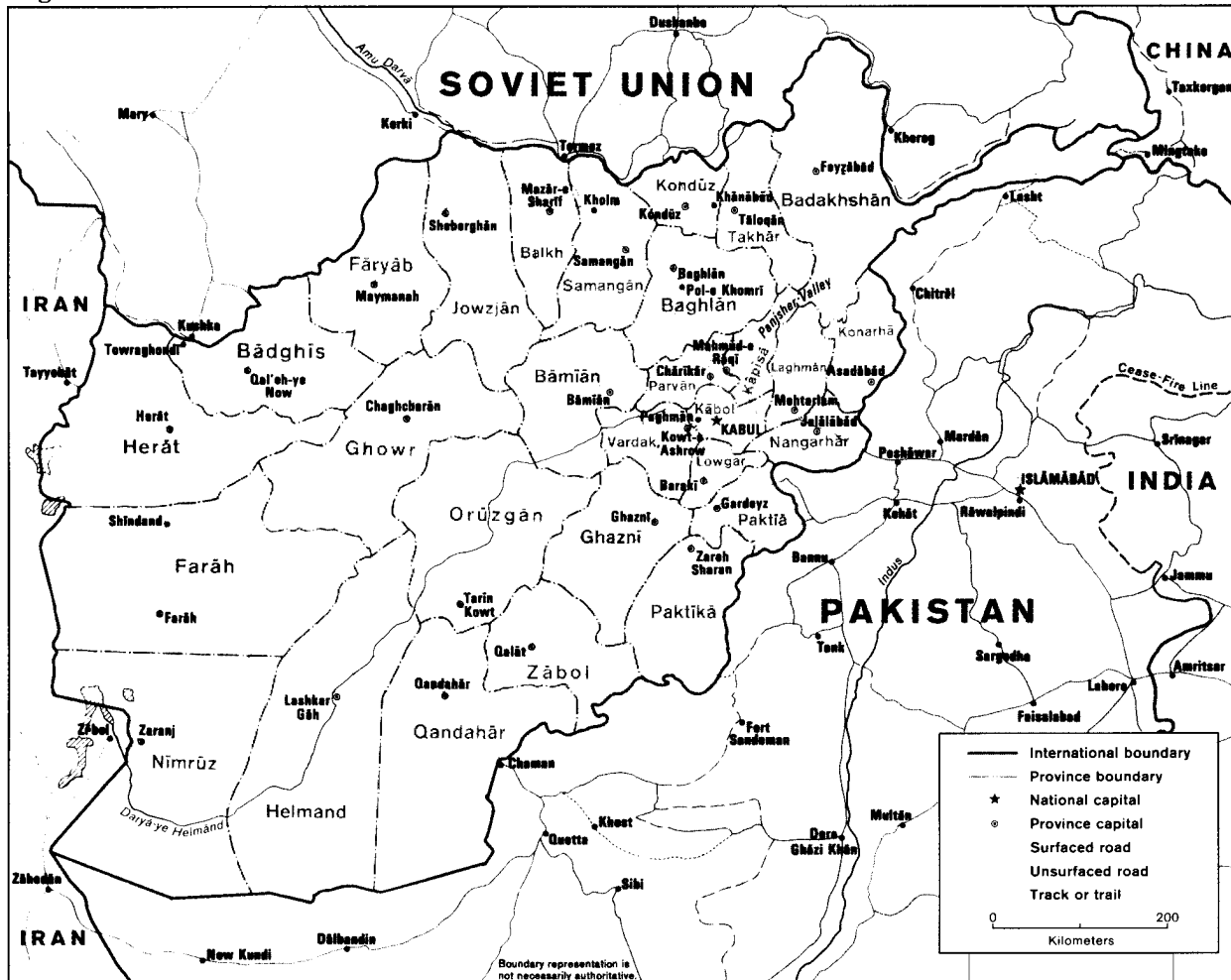
Figure 1 Afghanistan