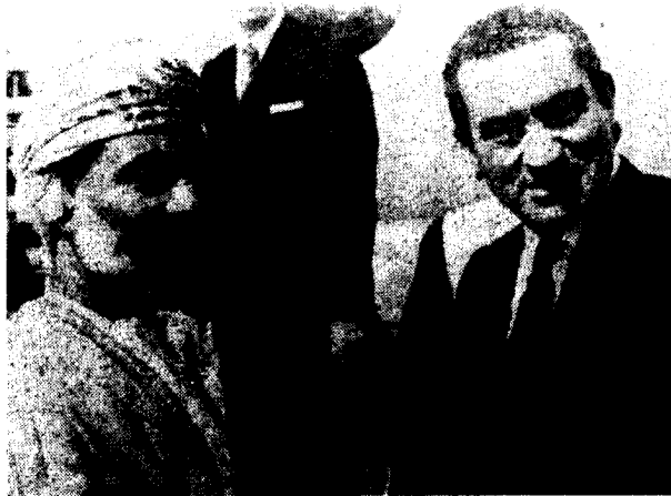
President Mubarak greets Omani Sultan Qaboos bin Said at Nonaligned Summit [redacted]