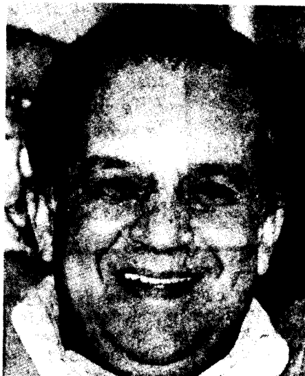
Mohammed Basri, exiled opposition leader, often uses religious themes to criticize the King. [redacted]

The Movement's members propagate a dogma based on strict loyalty to fundamentalist tenets as they define them. They reject as nonbelievers Moroccans who oppose their interpretation of Islamic tenets. Those scorned reportedly include government officials and political party leaders who, according to the militants, encourage divisive allegiances through Western political institutions. In their desire to remove all foreign influence from Morocco, they also reject the Moroccan constitution and legal code even though it is rooted in Islamic law. [redacted]