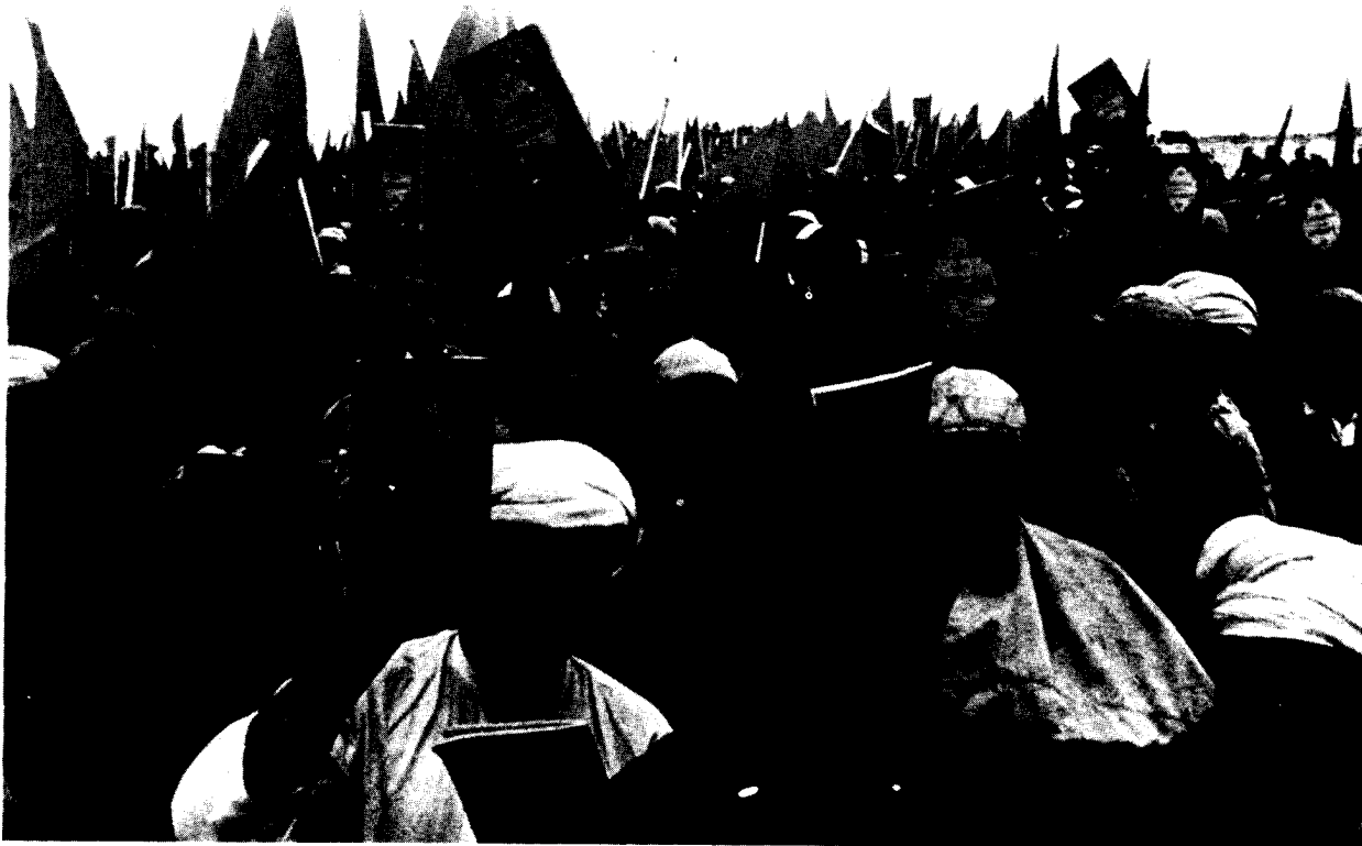
"Green March" participants, armed with the Quran and banners, march into Western Sahara on King Hassan's orders. [redacted]