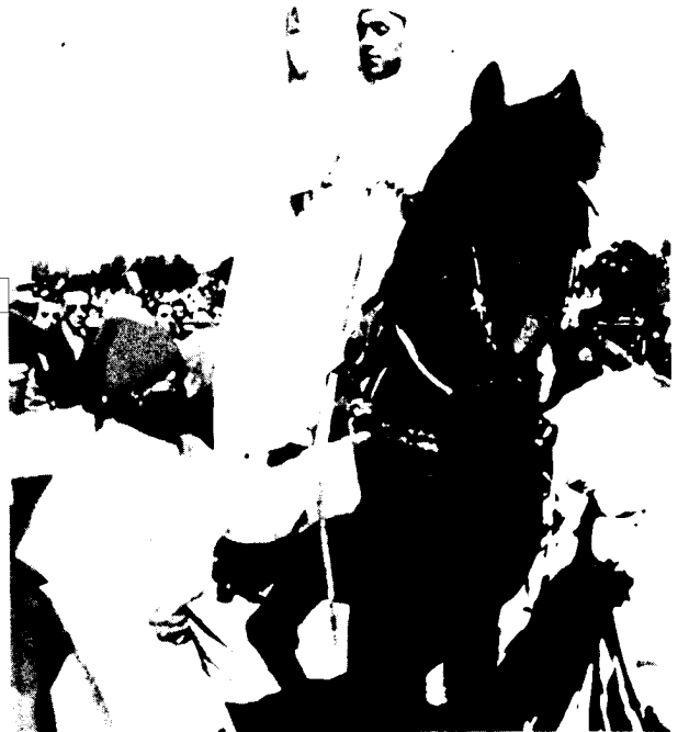
King Hassan II, Commander of the Faithful, rides to Friday prayers. [redacted]

The King relies on traditionalism and fealty to offset popular dissatisfaction with Morocco's political elite. Hassan has concluded that it is safer to enlarge his political base by allying with the rural elite—primarily Berbers—to resist demands of the urban middle class and political pressure groups. Thus far his bet has paid off. This de facto alliance affects the monarch's use of Islamic symbols since his most faithful clients are religious conservatives. A widely held belief in the religious authority of the King as Commander of the Faithful has tended to keep some Moroccans away from political battles for power. [redacted]