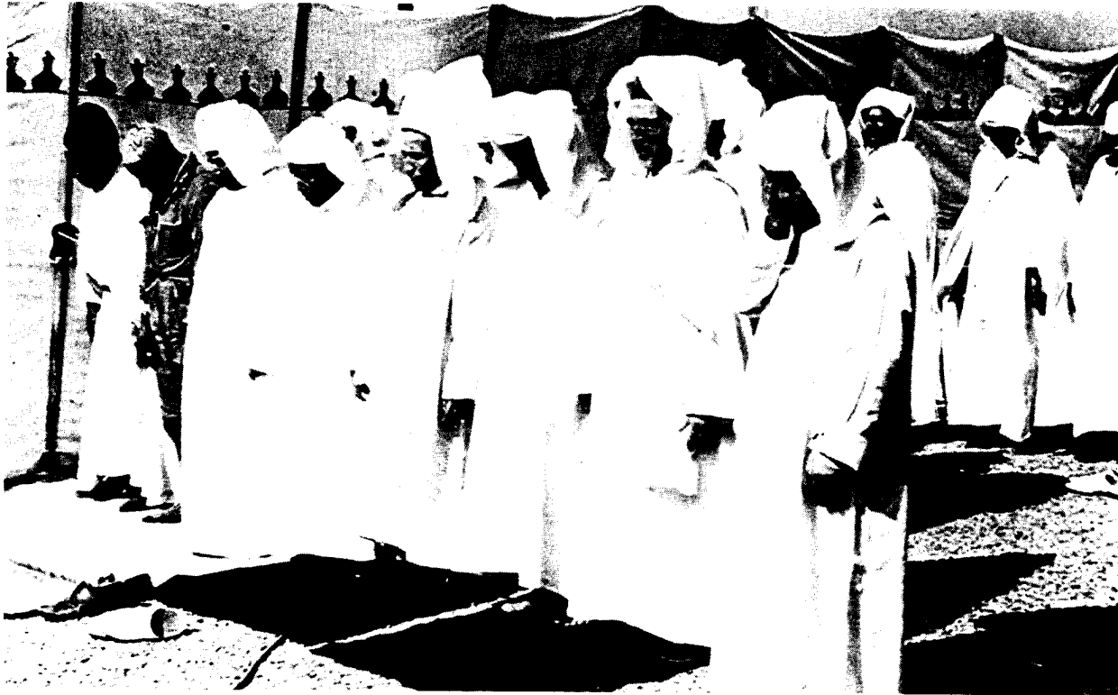
Observance of Islam has heightened in Morocco. Mosque attendance has increased. [redacted]