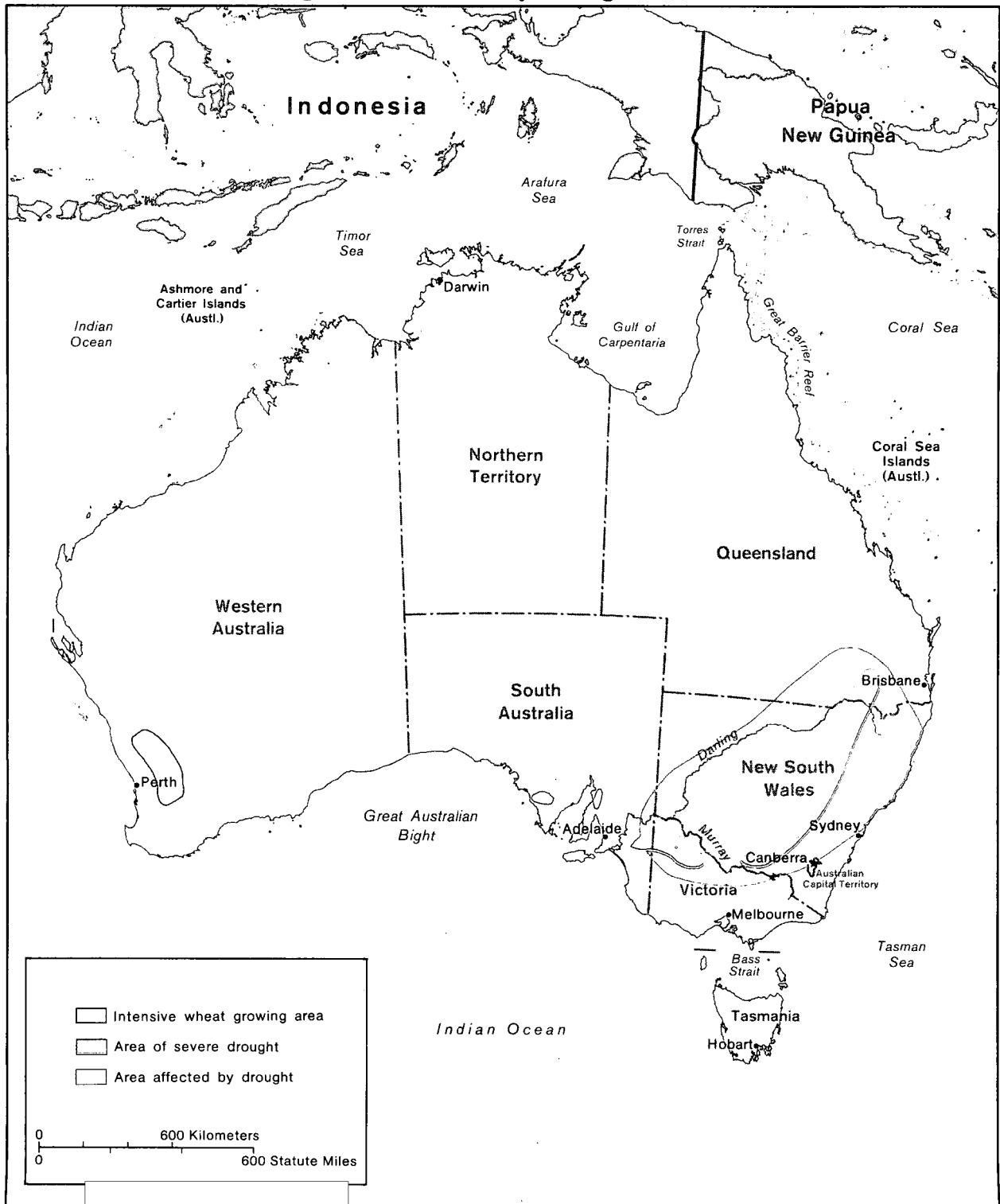
Figure 2 Australia: Wheat Growing Areas Affected by Drought