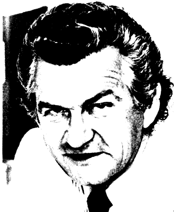
Bob Hawke. The son of a Congregational minister, 52-year-old Hawke is Australia's best known and most popular Labor Party and trade union figure. Having earned LL.B. and B.A. (economics) degrees in Australia, he went on to attend Oxford University under a Rhodes scholarship from 1953-55. Although unsuccessful in last July's leadership bid to replace Hayden, Hawke was elected ALP leader in February 1983, following the resignation of party leader Bill Hayden. [redacted]

attempt by Labor leaders to project a strong, confident, and moderate image in economic affairs, which both Fraser and the ALP are making the principal issue in the campaign. [redacted]