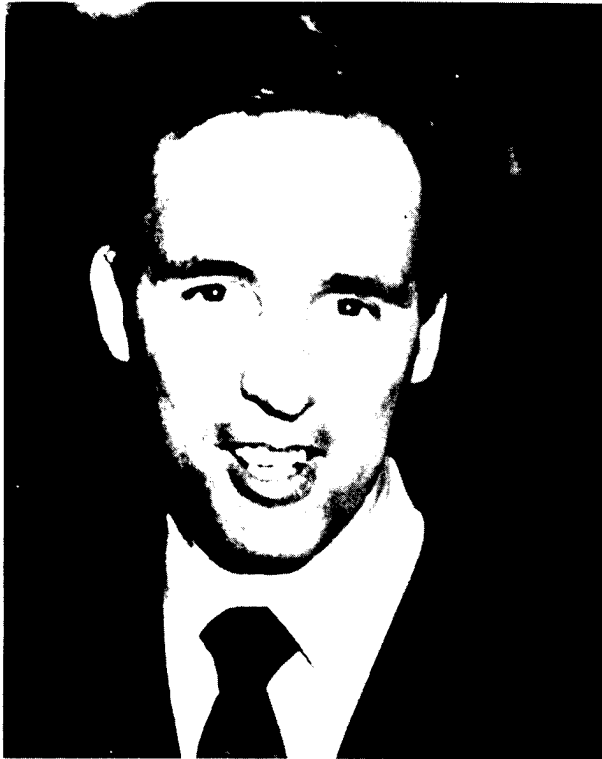
Paul Keating. At 39, Keating has been a member of the Australian Parliament for 14 years. A rightwing leader recognized for his imaginative policymaking and organizational abilities, Keating led his New South Wales Centre Unity faction in support of Hawke's leadership challenge despite criticism from the party's left wing. A formidable debator, Keating is considered a "comer" within the party and is tipped by many as future leader of the ALP. [redacted]