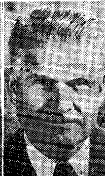
James J. Rowley