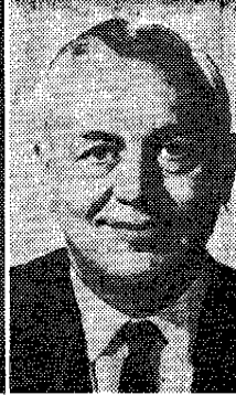
Arthur C. Lundahl