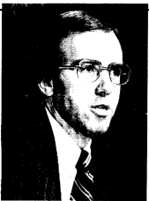
Congressman Michael D. Barnes (D-MD) U. S. House of Representatives