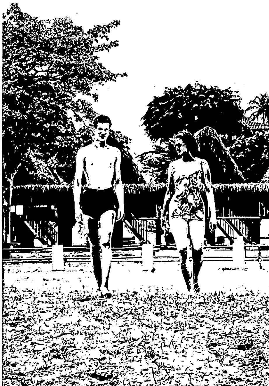
It's just a short stroll to the beach from new cottages at Santa Clara.

A big stride in this direction was the opening of the Government-owned Hotel Taboga, which is attracting large numbers of visitors to the beautiful island. Operated by the Hotel International, it offers fine