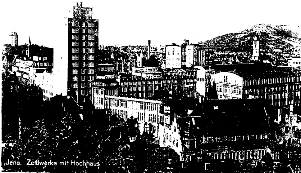
Jena. Zeißwerke mit Hochhaus