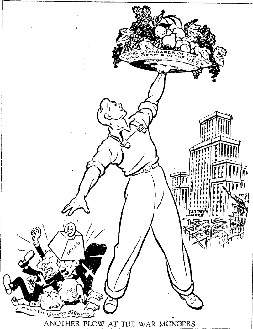
ANOTHER BLOW AT THE WAR-MONGERS

In the face of these facts, let us analyse the charge against the Soviet Government that it has embarked on a programme of large scale re-armament. Let us assume that the charge against the Soviet government about re-armament is true. In that case the simultaneous existence of the following conditions in the Soviet Union can not be explained by any known law of Economics: (1) There is a huge expansion of unproductive armament; (2) there is also a continuous reduction in the prices of commodities and goods for civilian consumption, (3) there is also a continuous policy of derationing; (4) and there is also 'nation