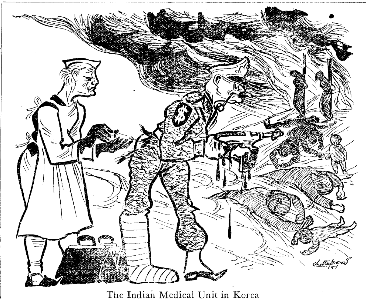
The Indian Medical Unit in Korea

I went to Berlin with a number of prejudices against the Germans. But I found that the common people everywhere are the same—friendly, peace-loving and affectionate. And I returned with a deep affection in my heart for the German women and men. May be some day we shall be able to build a strong women's movement in our country and invite the German women here.