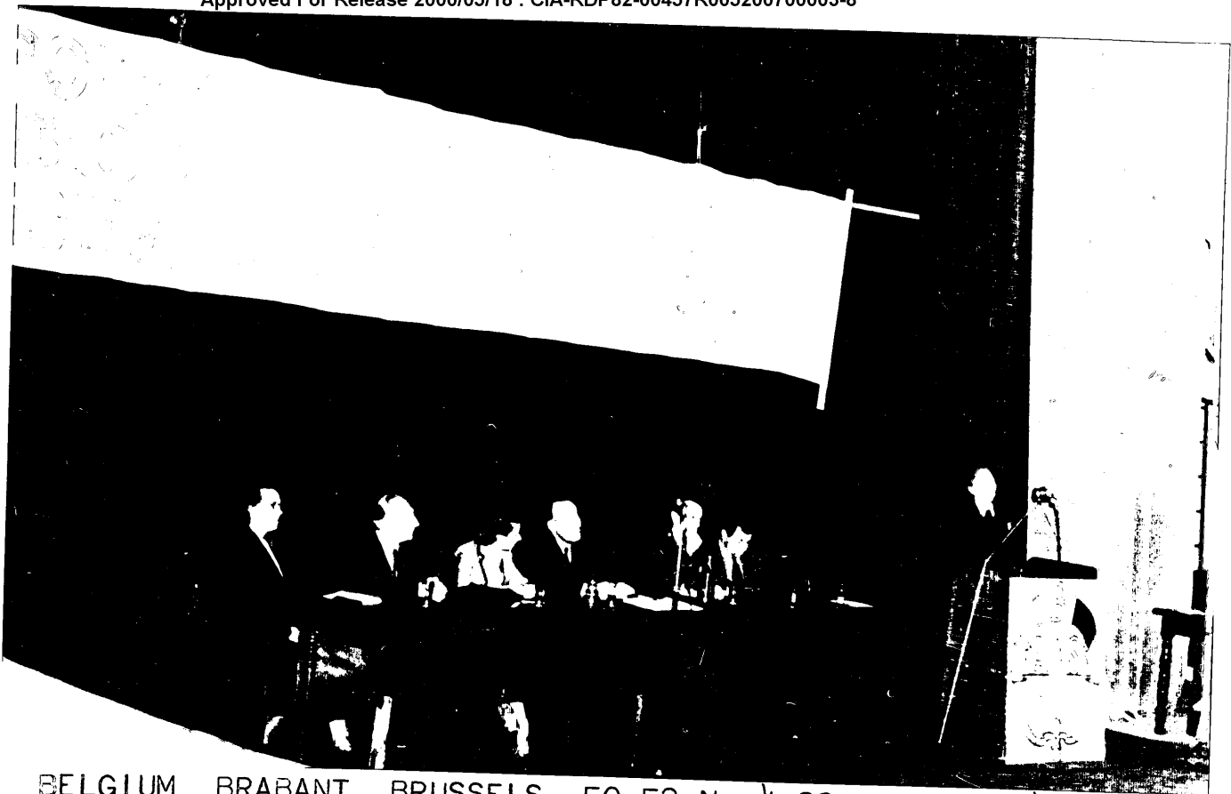
BELGIUM BRABANT BRUSSELS 50 52 N 4 22 E 24 MAY 50 CONFERENCE OF AMITIES BELGO SOVIETIQUES, BELGIAN-SOVIET FRIENDSHIP ASSOCIATION, TO PROMOTE OUTLAWING OF ATOM BOMB. CONFIDENTIAL/US OFFICIALS ONLY