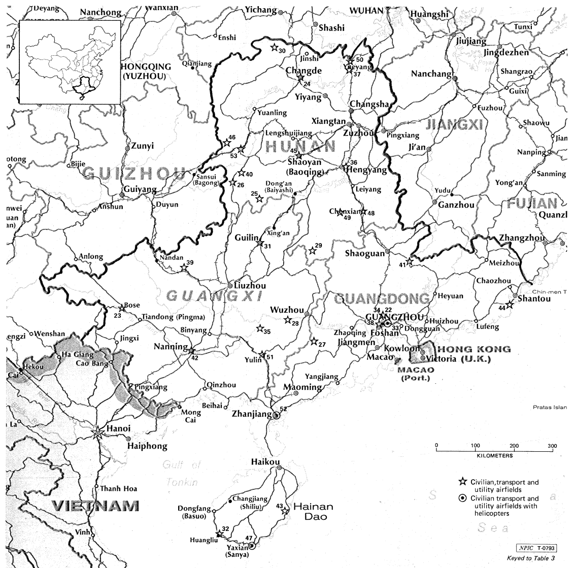
FIGURE 2. LOCATIONS OF CIVIL, UTILITY, AND HELICOPTER AIRFIELDS IN CHINA