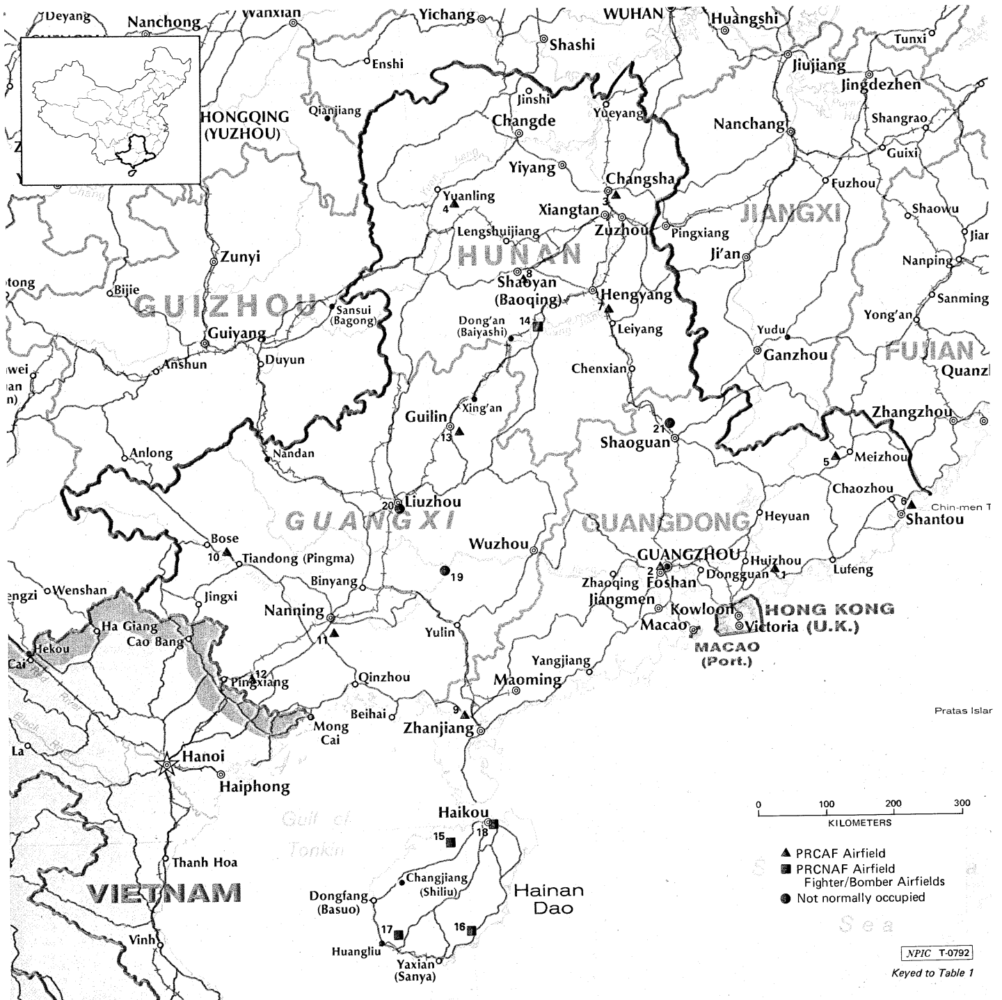
FIGURE 1. LOCATIONS OF PRCAF AND PRCNAF AIRFIELDS