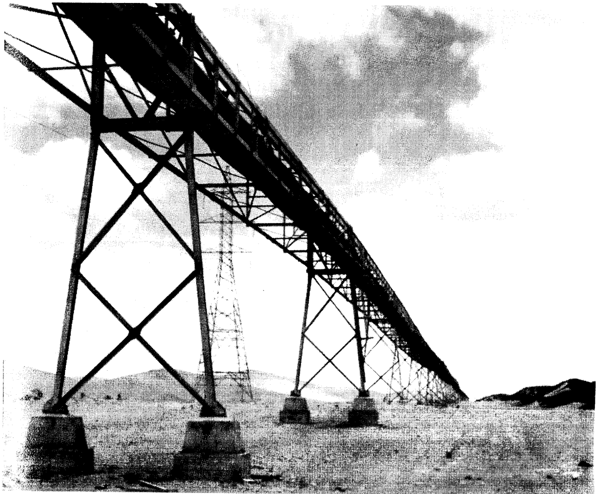
Automated conveyor belt rendered inoperative since early 1976 by sporadic guerrilla harassment.

Approved For Release 2001/09/03 : CIA-RDP81B00401R002800020044-5