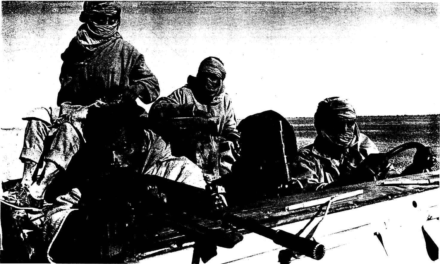
Guerrillas in Land Rover Departing for mission in Western Sahara.

Approved For Release 2001/09/03 : CIA-RDP81B00401R002800020044-5