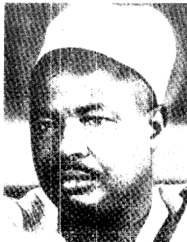
1969 Ahmadou Ahidjo Cameroon