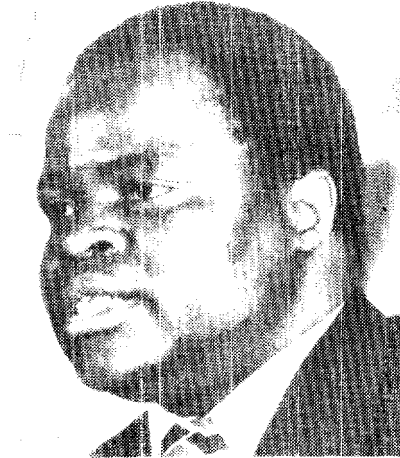
1972-74 Nzo Ekangaki Cameroon