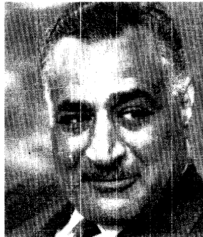
1964 Jamal 'Abd Al-Nasir Egypt