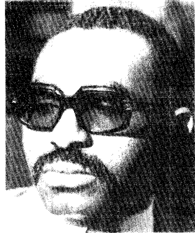
1974-78 Wm. Eteki-Mboumoua Cameroon