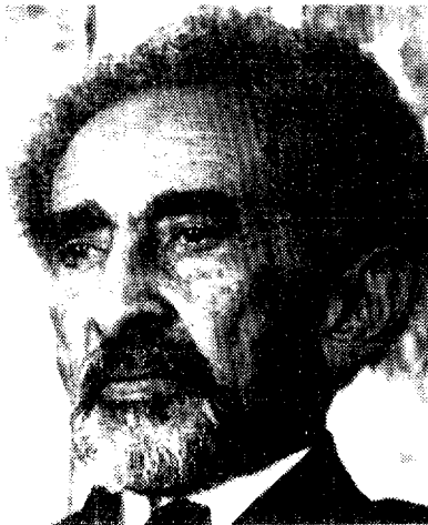
1963 Haile Selassie Ethiopia