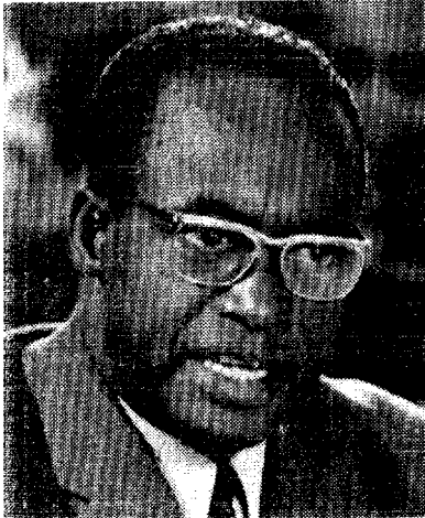
1964-72 Diallo Telli Guinea