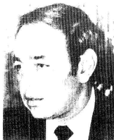
1977 King Hassan II Morocco