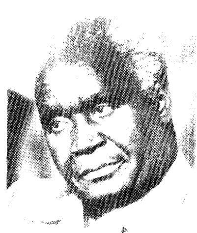
1971 Kenneth Kaunda Zambia