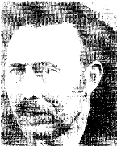
1968 Houari Boumediene Algeria