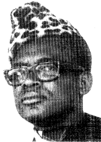
1967 Sese Seko Mobutu Zaire