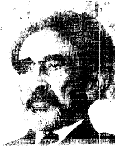
1966 Haile Selassie Ethiopia