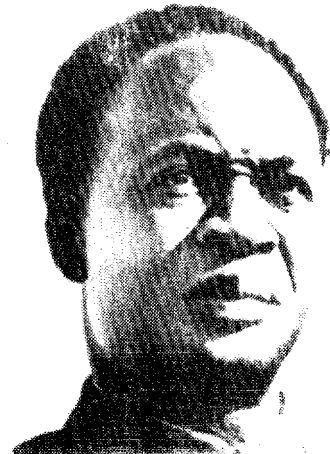
1965 Kwame Nkrumah Ghana