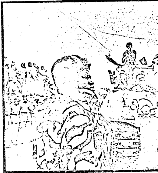
A bloodless coup in Uganda in January last and installed Major-General Idi Amin as military ruler (Amin is shown in a section of his troops). How far was the CIA involved in the coup? A pro-rebel poster attacks American intervention

The British Government - particularly after the Labour Party had come to power in 1964 - withdrew most of their SIS and MI5 officials from African capitals, though some remained, at the request of the rulers, to organise their own new intelligence and security services. CIA