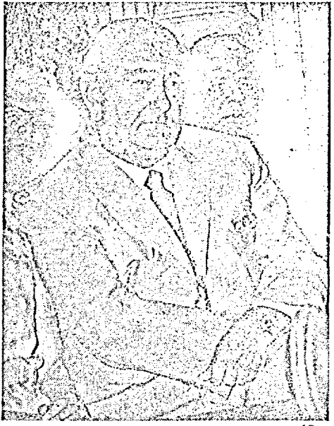
Johnson, 1971: Ammunition in Austin

The ghostly hand of Robert Kennedy is on the Pentagon study. Bobby indeed may well have inspired the report. He was close to Robert McNamara and