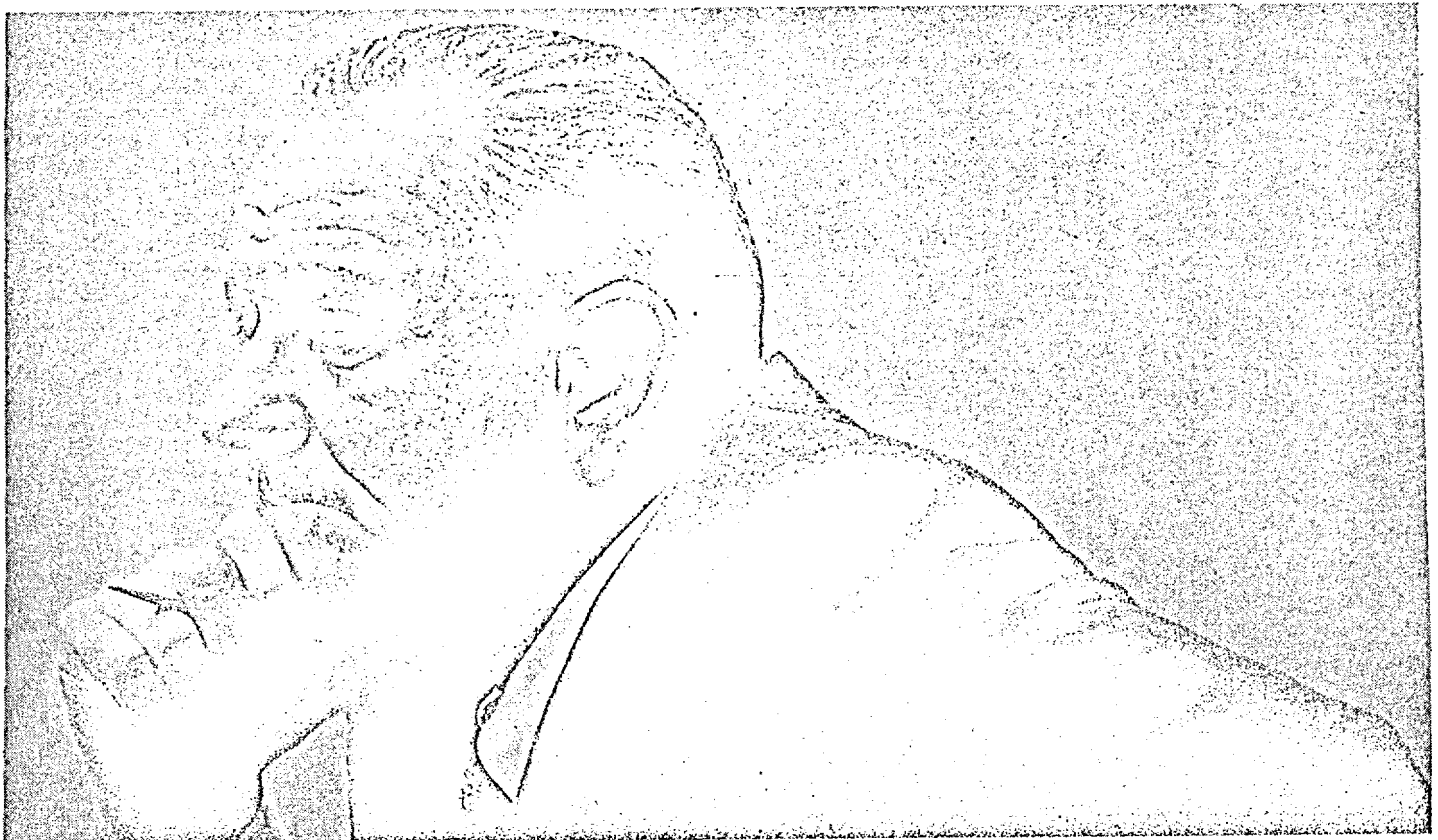
JULY 1965: JOHNSON DISCUSSING VIET NAM POLICY BEFORE TELEVISION SPEECH Always the secret option, another notch, but never victory.