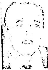
WILLIAM F. BUCKLEY JR.