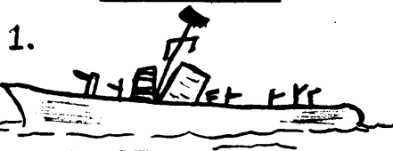
Soviet Naval Vessels Observed in Ventspils Harbor