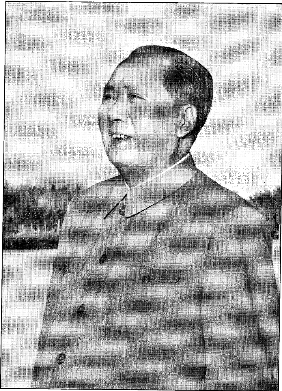
The most recently published available photograph of Mao Tse-tung, from the 21 January People's Daily . Like all formal portraits of Mao, it is either retouched or not a recent photograph.

16 Feb 66 [REDACTED] CENTRAL INTELLIGENCE BULLETIN Photo