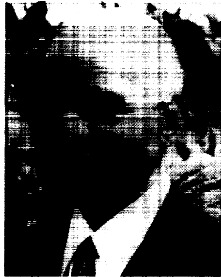
President Banda. (U)

Under the authoritarian leadership of President H. Kamuzu Banda, Malawi has become one of Africa's most stable and conservative countries. Banda shows no interest in retiring despite his advancing age (he claims to be 73, but probably is closer to 80), and he is likely to die in office. Although Banda has carefully avoided designating a successor, he has devised a complex constitutional system for the selection of the next president. The ability of his colleagues to carry out these provisions will have much to do with whether Malawi's carefully nurtured stability departs with Banda. There is no Vice President in Malawi and, at a minimum, there is likely to be a period of intense political infighting as various competitors struggle to grasp Banda's mantle. None of the potential successors seems likely to continue all of Banda's extremely conservative policies, which have made Malawi something of a pariah in black Africa, although all contenders will probably maintain close relations with the West. (S)